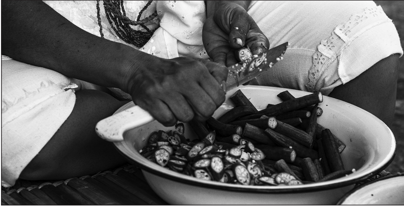
Author's personal archives.