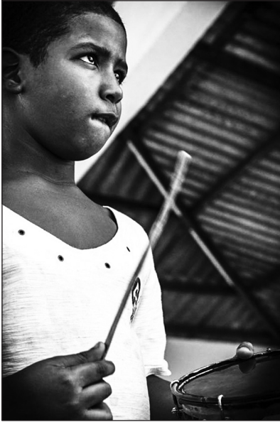
Omorobá Aşę João Vitor ti Airá.

first person in the boat is “ Dofono .” 16 He also emphasizes the daily coexistence as a fundamental condition for learning the language. “People ask for something in Yorubá and then we learn by repeating; people explain and then we learn and memorize the words”. But the Dofonitinho de Oşalá reminds us that there is a period dedicated especially to learning the practices, dances, prayers, songs and language.