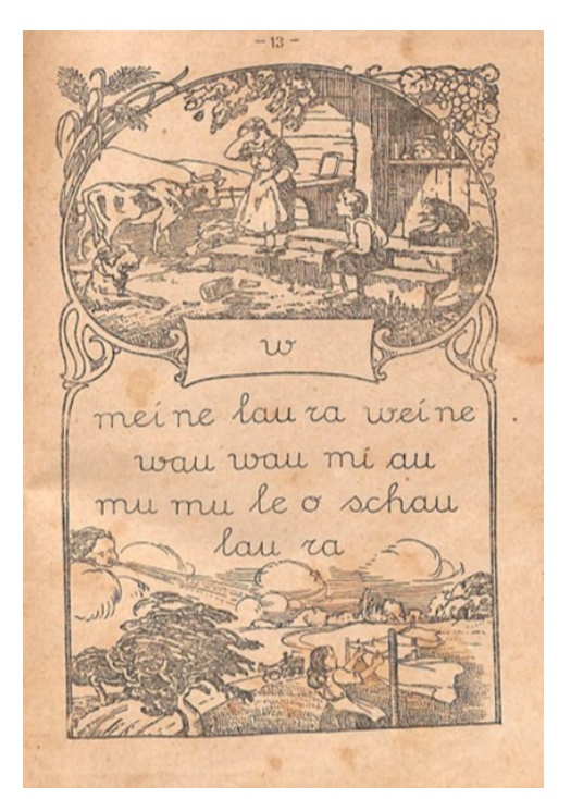
Figure 6 – Woman and household chores

We can observe that, through the representation of specific activities, the primer tends to show different behaviors for men and women at work. On figure 5, we see activities attributed to men. On the lower part of the image, we see a man spreading seeds on the ground and on the upper part there are children playing as if in a civic parade, in which three boys march with their toy weapons, another rides a wooden horse with a raised sword, and a girl carries a flag.