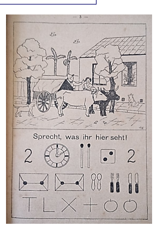
Figure 9 – The travelling salesman

Figure 9 suggests that the man represented in the image is a travelling salesman, as the wagon has a cover, showing that there is some type of good protected under the tent. In the lower part of the image, there are the items sold, such as matches, cutlery, clocks, dice, and postcards. Besides this, the image shows the man gesticulating while the woman observes him, suggesting a dialogue between both. However, through the context of the illustration, it is possible to notice that the woman is in a domestic space, a context that meets Salomani's (1996) ideas that the domestic care was under women's responsibility, while men, regardless of his occupation, was always represented in an activity outside the domestic environment. Similarly, figure 10, one of the many representations on the primer Mein Rechenbuch , shows a man in a commercial activity.