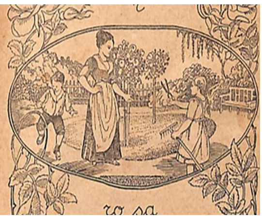
Figure 4 – Girl helping the mother

We can see that both figures are connected to activities related to the work world. In figure 3, we can see the representation of a boy helping his father in a farm activity, socially considered as practices from the male universe. The boy is shown holding nails while the father fixes the fence. On figure 4, the girl is helping the mother in the domestic chores, helping with the garden. The girl is shown holding a rake in one hand and garden scissors on the other which she is giving to the mother, while the boy is running through the yard. Thus, we understand that such images reflect family structures and ways of organization, because, as stated by Louro (1994), men and women build themselves during the process of social and family relational practices.