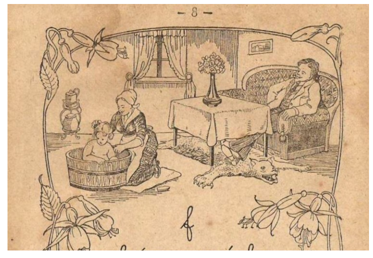
Figure 7 – Mother bathing the child, while the father rests

In this sense, Fibel visual representations show a reproduction of social gender divisions in the family, a space built by cultural unities. Such division can be seen in figure 7, below, that shows a man resting while the woman bathes the child.