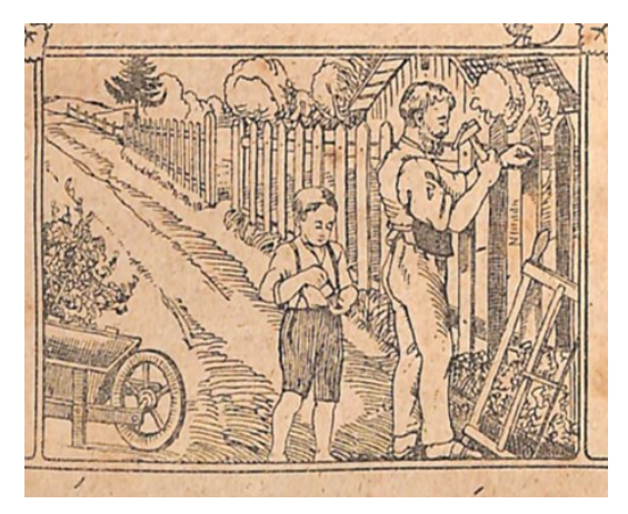
Figure 3 – Boy helping the father

Thus, the content of the primers is organized to contemplate students' reality, so that the illustrations present situations involving activities and habits common to their universe. In some of these representations, we can see the construction of a difference between the typical works of men and women. Such distinction can be seen in figures 3 and 4, below, copied from Fibel , in which the boy is represented helping the father and the girl is gardening beside the mother.