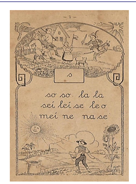
Figure 5 – Man working on the field