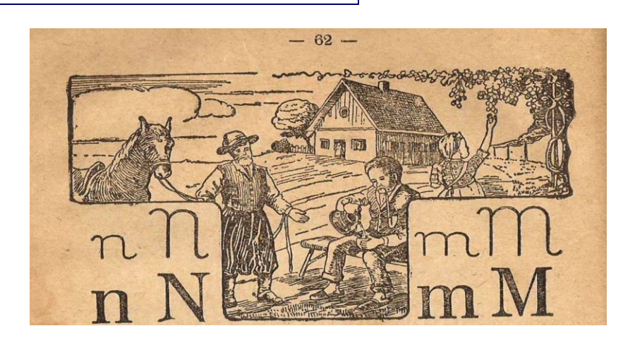
Figure 8 – The dialogue between a German descendant and a gaúcho <sup>19</sup>

Figure 8 shows a mixture of cultures, the result of the contact between German descendants and the gaúchos , allowing the incorporation of habits and traditions. We can see the image of a woman that does not directly participate of the conversation, but is represented harvesting grapes, while another woman is by the door of the house, observing from afar. The illustration reinforces Salomani's (1996) analysis, according to which German-Pomeranian women tended not to get directly involved in negotiations outside the domestic sphere, what does not mean that they did not act in the background and, consequently, influenced the husbands' decisions.