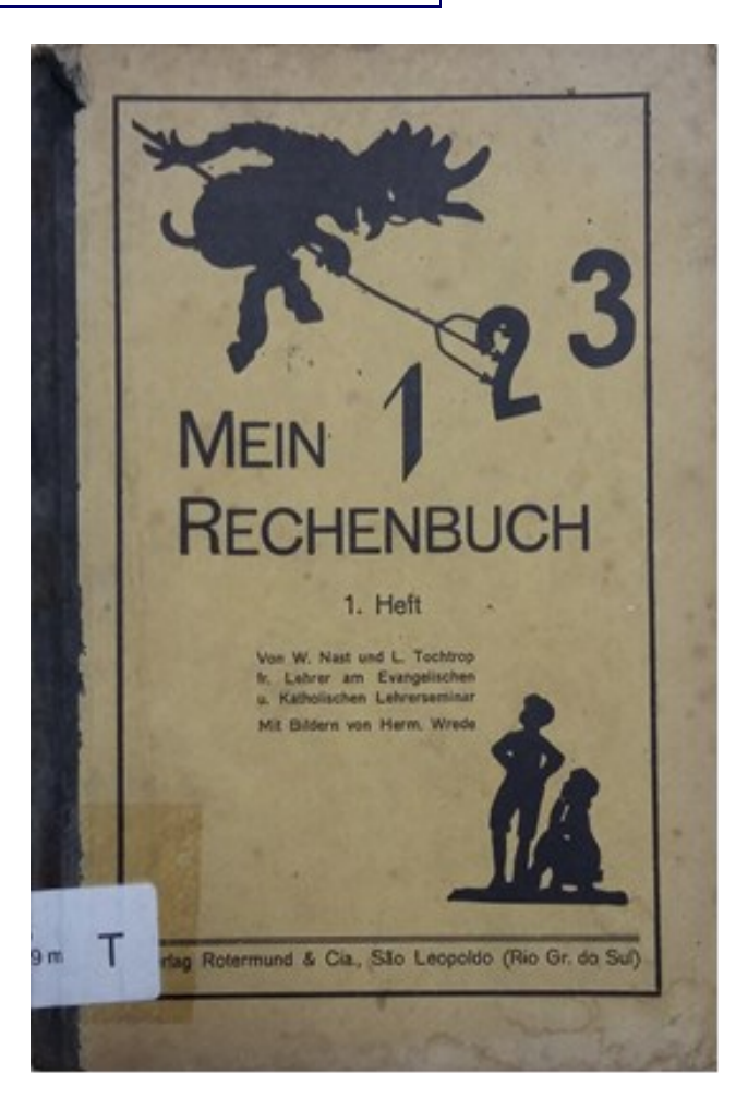
Figure 2 – Cover of Mein Rechenbuch

The primer Mein Rechenbuch was printed in 1933 and is the first of four<sup>14</sup> primer booklets produced aiming to help protestant and catholic teachers when teaching a "more fruitful and beneficial mental mathematics", as explained on the preface. It was written by the two authors– W. Nast and L. Tochtrop – and illustrated by Hermann Wrede.