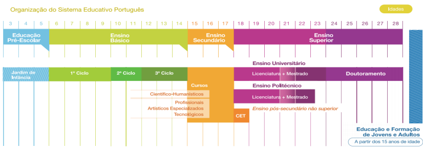
FIGURE 1 – PORTUGUESE EDUCATIONAL SYSTEM