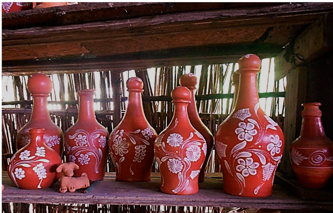
Figure 4- Moringas (water jugs) in a pottery shop

The pottery of Maragogipinho is traditionally painted with pigments made from the clay itself. Tabatinga and tauá are used as paint. The tabatinga is a white engobe 5 and the tauá is a red engobe. This meticulous technique of painting white markings in a red background, or vice versa, refers to indigenous representations, as well as floral motifs to Portuguese representations. The brushes used by the older painters are still made with the hair of a cat's back, tied to a thin stem of palm. They are true instruments of precision, in which the trim of the hair gradually attenuates to the point, to guarantee a fine and meticulous brushstroke.