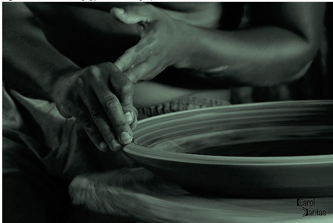
Figure 1- Potter in Maragogipinho modeling a plate