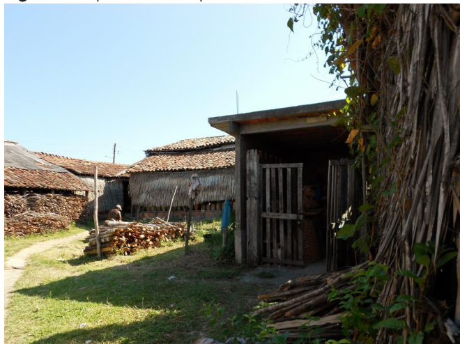
Figure 6- A path between potteries

The oldest potteries are located next to the river, in a wide mangrove terrain. Potteries are traditional sheds constructed with wood structure, piçava palm straw walls and tile roofing. This ancestral architectural design facilitates air circulation and natural lighting of the space, essential aspects for the drying of the pieces and the environmental comfort of the workers, in a region