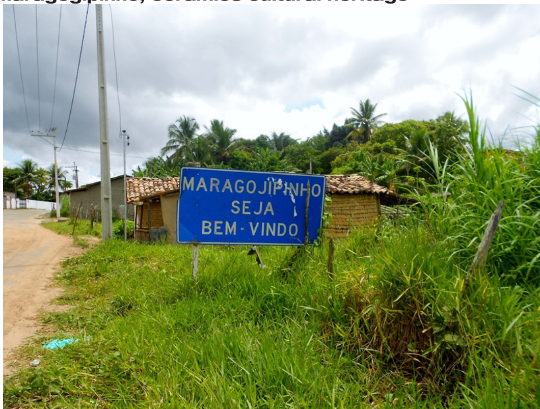
Figure 2- Outdoor sign at the entrance of the village of Maragogipinho (BA)

Maragogipinho is a neighborhood somewhat away from the urban center municipality of Aratuípe (fig.2), in Bahia, located 130 kilometers from Salvador. It is located in the Recôncavo Baiano, a region of great cultural wealth and traditions. The Recôncavo comprises an extensive