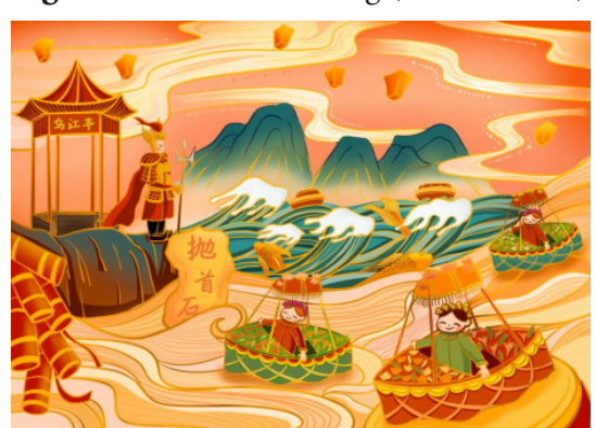
Fig. 8 – Land boat dancing (student work)

The annual Temple Fair of the Overlord Temple on the third day of the third lunar month features traditional entertainment, such as singing opera and land boat dancing, and brings together food and amusement based on the integration of folk crafts, creating a lively and festive atmosphere that reflects the cultural characteristics of the Overlord Temple fair and a Chinese fashion trend. For example, when introducing and displaying the traditional cultural activity of land boat dancing during the temple fair, the overall design is based on warm colors, with Wujiang River Pavilion and Xiang Yu dressed in general's attire on the left of the picture and people racing land boats in the middle and right of the picture.