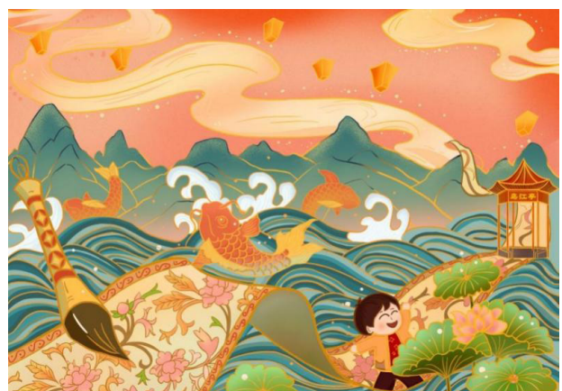
Fig. 3 – Painting and calligraphy exhibition (Student work)

effectively preserve and pass down rural folk culture by combining traditional elements with the Chinese fashion trend.