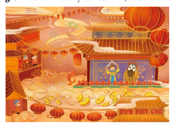
Fig. 7 – Farewell to my concubine (student work)

For example, when introducing the story behind the Overlord Temple, Xiang Yu and his beloved Concubine Yu's story can be incorporated into the illustrated story, combined with the unique architecture of the Overlord Temple, to present Xiang Yu and Concubine Yu's drama elements. This approach can not only showcase the historical background of the event but also promote the corresponding traditional culture of the region, achieving two goals with one stone.