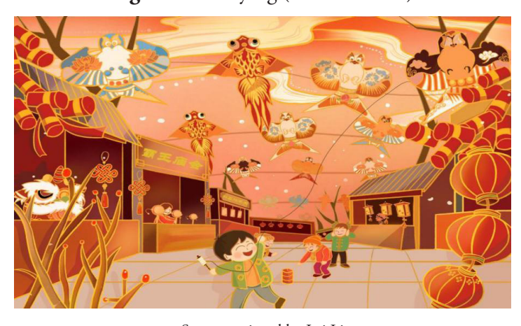
Fig. 4 – Kite flying (Student work)