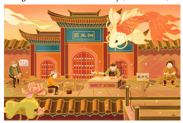
Fig. 5 – Traditional craftsmanship (Student work)

The illustration design of "Temple Fair of the Overlord Temple on the third day of the third lunar month" adopts horizontal composition to make the scene of the picture more natural and help enhance the rhythm of it (Han; Duo; Zheng, 2022, p. 2499). The flat processing of the picture makes it livelier and accords with the atmosphere of the temple fair. The warm color system highlights the thriving atmosphere of the temple fair and strives to restore the grand occasion of the "Temple Fair of the Overlord Temple on the third day of the third lunar month". Since the temple fair, as a traditional folk custom, has many folk activities that have been passed down for a long time, the perfect combination of the temple fair and Overlord Temple can achieve the effect of publicity.