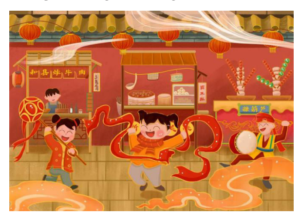
Fig. 6 – Yangko dancing (Student work)

traditional culture in the optimal and innovative design of the Overlord Temple and avoid design deviation and serious problems such as content homogenization. In a word, the distinctive local design of the Overlord Temple can be used to avoid affecting the effect of the inheritance of rural folk customs.