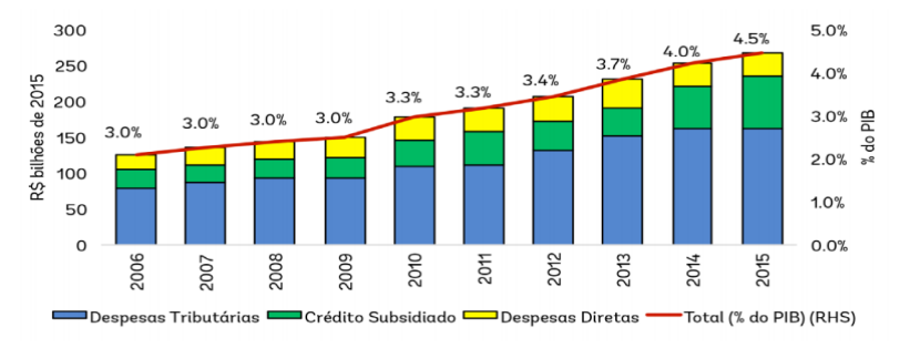
GRAPHIC 1 – "BOLSA EMPRESÁRIO": TAX EXEMPTIONS, SUBSIDIZED CREDIT AND DIRECT TRANSFERS BENEFIT THE PRIVATE SECTOR

Based on the data provided by the National treasure over the incentives and subsidies granted annually by the Brazilian federal government, the World Bank prediction (2018) about the main challenges for the Brazilian economic and social development, such as fiscal imbalance, highlights: "today about 6,2% of the GDP is spent with tax incentives of several types, 4,3% are addressed to tax exemptions and 1,9% to tax subsidies and subsidized credit". It is also said that "three quarter of these tax subsidies and tax exemption give direct benefits to the private sector enterprises" (WORLD BANK, 2018, p. 13). The direct resources transfers to private enterprises is illustrated by the World Bank in the following graphic: