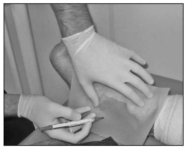
Figure1 – Delimitation of the ulcer area contours on vegetal paper

To apply planimetry, a vegetal paper with 70% alcohol was placed on the ulcer and fixed to contour the ulcer border, using a pen. After marking the ulcer on the vegetal paper, two methods were employed to determine the total ulcer area: 1) superposition of the vegetal paper on millimeter paper<sup>(23)</sup>, and counting of the number of squares in the ulcer area to determine its area in square millimeters (mm<sup>2</sup>); 2) digitalizing of images obtained on the vegetal paper for measuring using Image J® software<sup>(24)</sup>, compared with the known area of a standard reference (Figure 1).