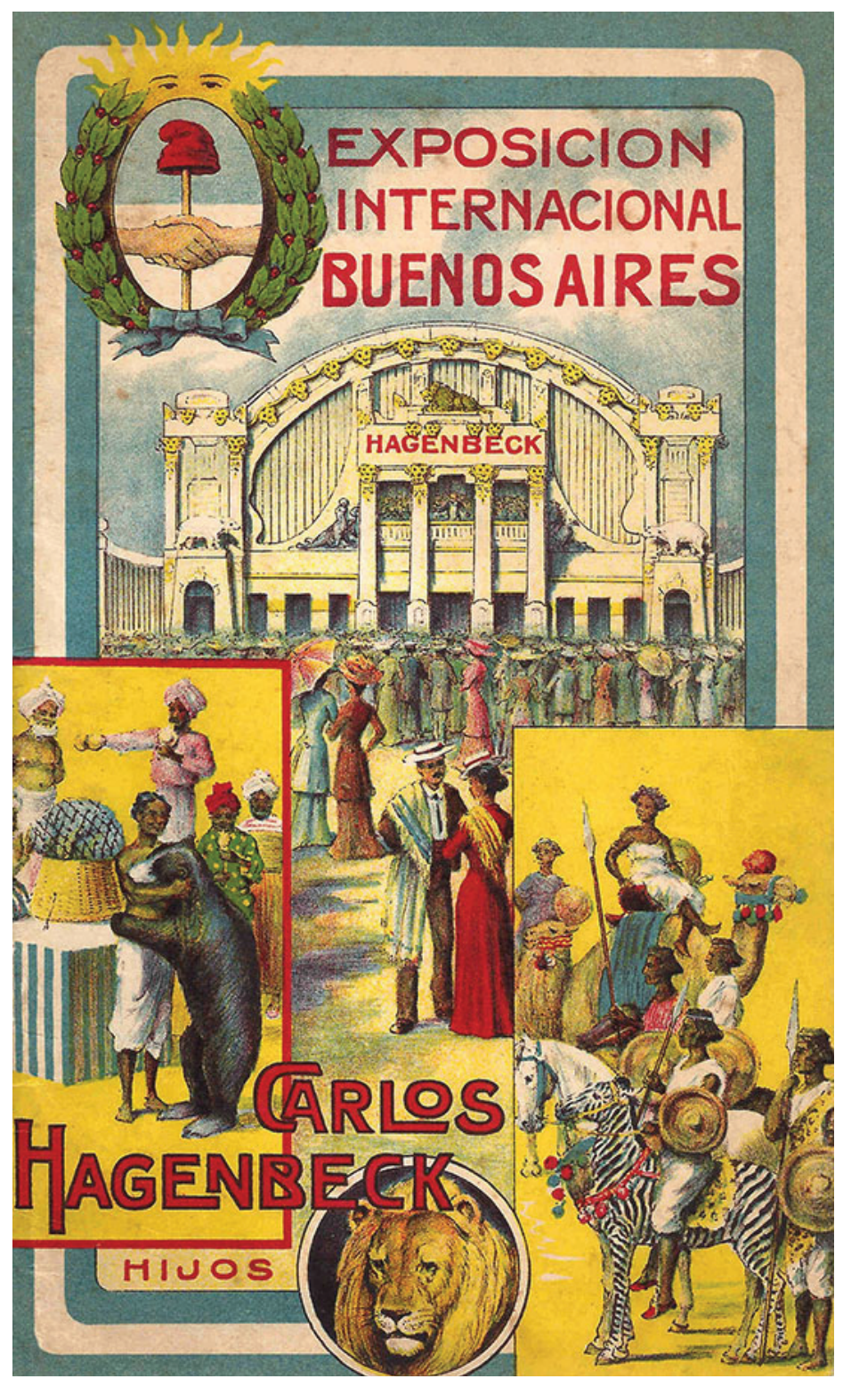
Figure 3: Cover of Hagenbeck's advertising brochure, 1910