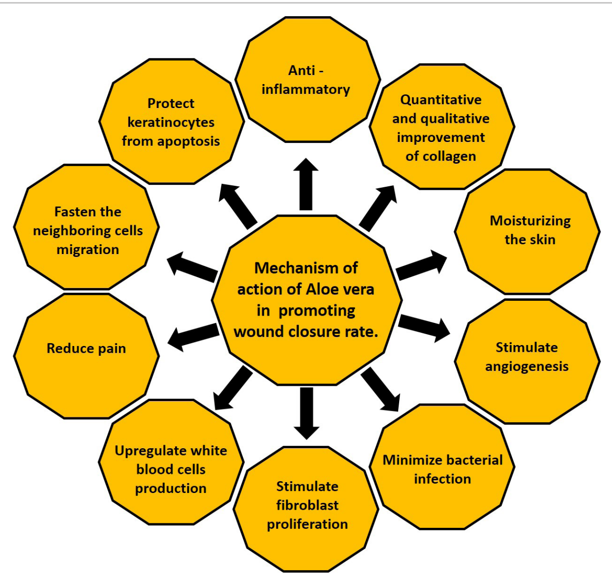
FIGURE 3 - Action mechanism of Aloe vera in promoting wound healing.