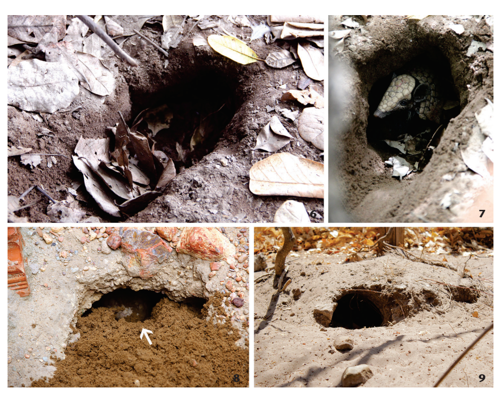
Figures 6-9. (6) Burrow of Tolypeutes tricinctus with entrance covered by leaves at Buriti dos Montes, Piauí. (7) Animal leaving the burrow after removal of the leaf litter cover. (8) An individual of T. tricinctus actively digging as an escape behavior at Buriti dos Montes. (9) Burrow dug by T. tricinctus in semi-captive conditions at Reserva Natural Serra das Almas, Ceará.

the individuals of Tolypeutes were found are congruent with the animal size and carapace shape. When observing animals entering and exiting the small burrows, the perfect congruence of the shape of the carapace and that of the burrow is evident (Appendices S2* and S3*).