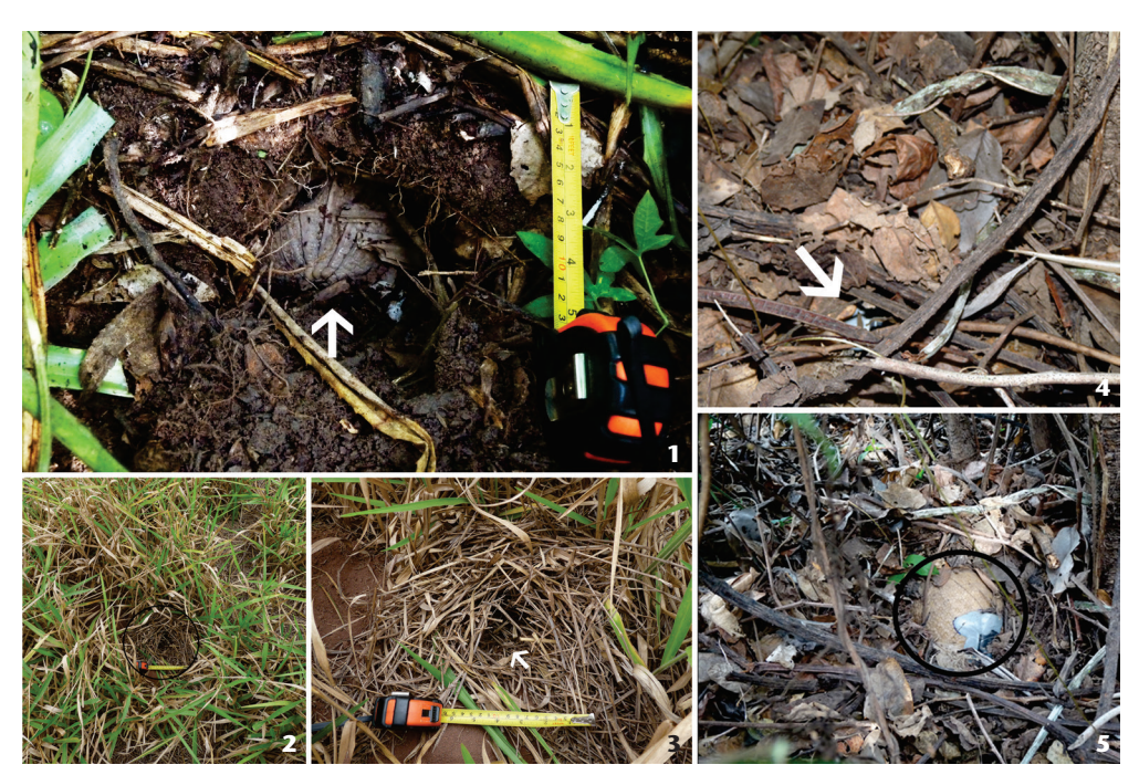
Figures 1-5. (1) An individual of Tolypeutes matacus (arrow) resting inside its burrow at Santa Teresa Ranch, Corumbá, Mato Grosso do Sul. (2-3) Straw-nest built by T. matacus in a pasture area at Duas Lagoas Ranch, Cáceres, Mato Grosso: (2) upper view of the nest (circle) and (3) close-up of the same nest (arrow indicates the entrance of the nest). (4-5) (4) An almost imperceptible individual of T. matacus resting in a depression under leaf litter at Santa Teresa Ranch, Corumbá. The arrow points to the only visible part of the carapace. (5) The same GPS-fitted animal resting in the depression after we manually removed some of the leaf litter to expose part of its carapace (circled).

Despite the occurrence of three other armadillo species – Euphractus sexcinctus (Linnaeus, 1758), Cabassous unicinctus (Linnaeus, 1758) and Dasypus novemcinctus Linnaeus, 1758) – and at least four other burrowing animals (iguanas, agoutis, pacas and the spiny rat) at our study sites, T. matacus was never found using burrows resembling those belonging to other species.