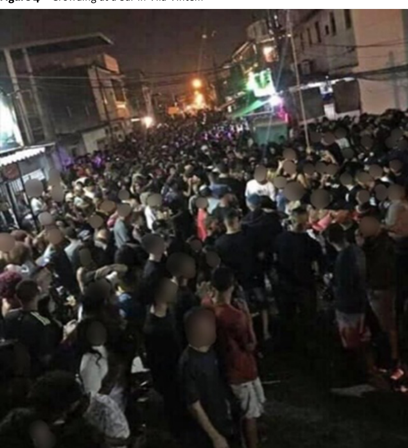
Figure 4 - Crowding at a bar in Vila Vintém

The image depicts a street completely packed with people, leaving little space to walk. The photo also "went viral" on digital networks such as Twitter and Facebook, causing deep discomfort among local residents and criminals. There were already orders to end such overcrowding situations in the favela. Following this incident, drug dealers took action and closed the bar with chains and padlocks. This was a display of their power to arbitrate in the territory. The owner of the bar did not suffer physical or violent retaliations, but his establishment was closed without financial compensation.