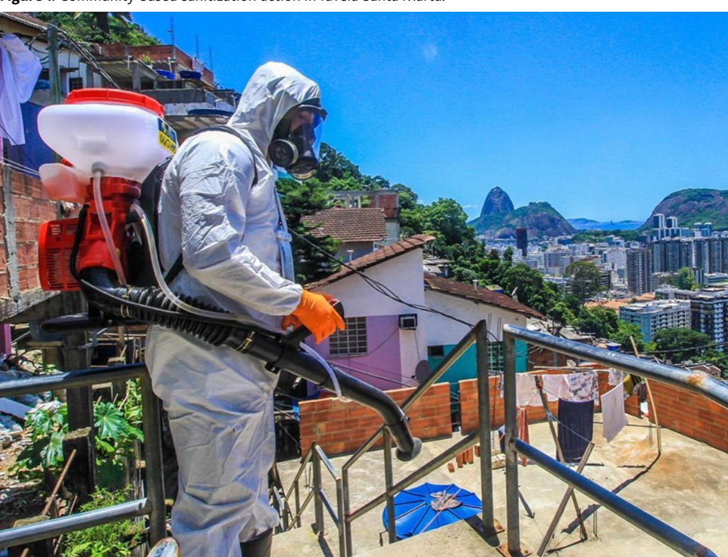
Figure 1: Community-based sanitization action in favela Santa Marta.

During the first months of 2020, an unusual sight was witnessed among these workers and their daily hustle: a group of people wearing personal protective equipment, spraying chemical products, and walking at a slower pace. Dodging local residents who descended the stairs towards the exits of the favela, this group of people in distinctive white suits moved in the opposite direction, going up the hills and further into the territory.