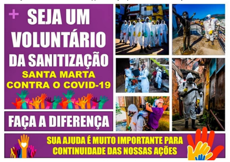
Figure 2 : Poster promoting the community-based action in the favela: "Be a volunteer for sanitization – Santa Marta against Covid-19 – Make a difference – Your support is very important to the continuity of our actions".