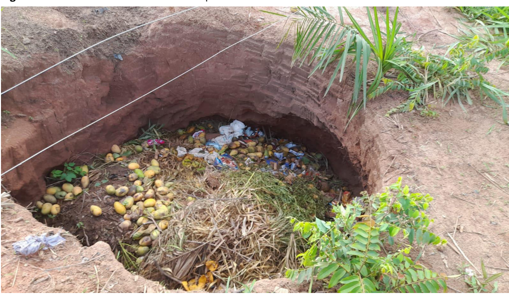
Figure 2 - Hole where discarded waste is deposited and burned

The Hawks throw the industrial waste that does not decay into a large hole in the back of the houses. When the hole is full, they burn the waste. What does not deteriorate immediately remains in the hole. Each hole is used for years, but everyone knows that it will not be used forever. If the population is growing, as is the consumption and disposal of garbage in the village, this problem motivates the Gavião to deal with their garbage.