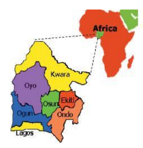
Figure 1 - www.nigerianstat.gov.ng/nada/index.php/catalog. Accessed 19th January, 2019