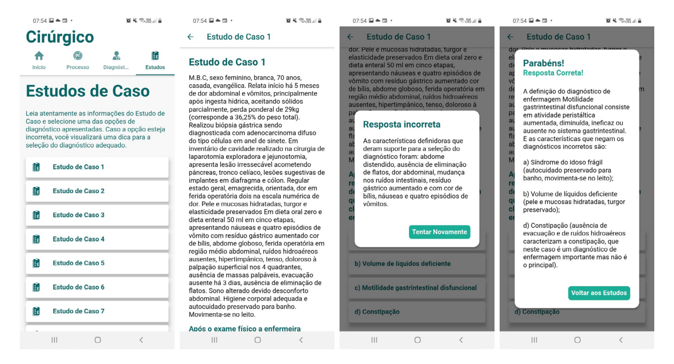
Figure 2 - Main menu and Nursing Process of CuidarTech® Cirúrgico function. Vitória, ES, Brasil, 2019.