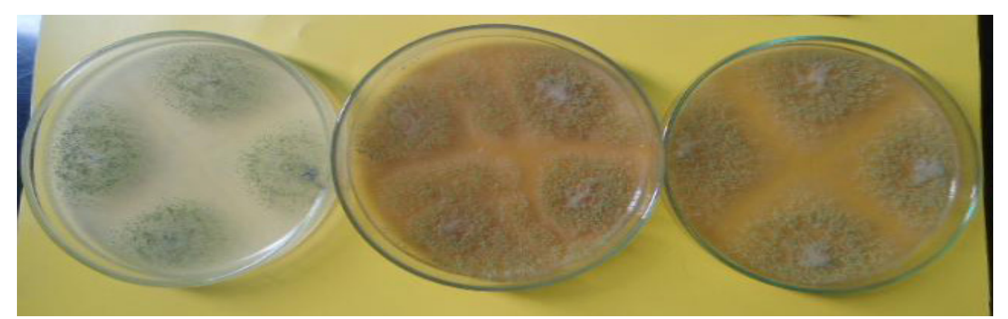
Figura 1. Cultural characteristics of Aspergillius flavus grown on three types of culture media: from left to right, potato dextrose agar (PDA), yeast extract sucrose agar (YES), and Sabouraud dextrose agar (SDA).