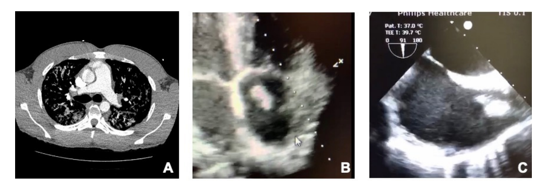
FIGURE 2: CTPA with filling defects in the pulmonary arteries bilaterally (A), transthoracic (B), and transesophageal (C) echocardiography showing thrombus in the right atrium. CTPA: computed tomography pulmonary angiogram.