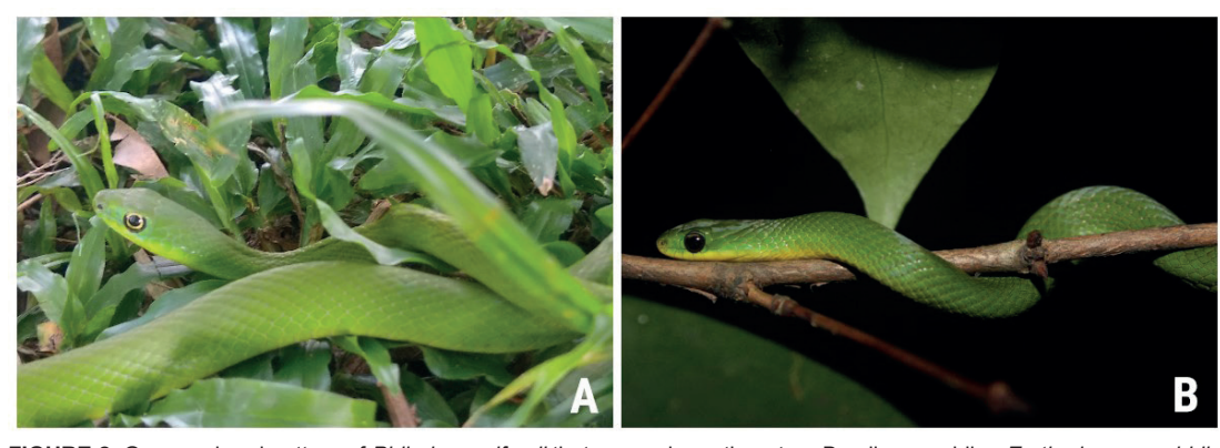
FIGURE 2. Green colored pattern of Philodryas olfersii that occurs in northeastern Brazil, resembling Erythrolamprus viridis . (A) P. olfersii ; (B) E. viridis .

Therefore, our report reinforces the precautions and care that professional or amateur herpetologists must take in handling many opsisthoglyphous snakes. Although the number of envenomations caused by opsisthoglyphous snakes in Brazil is low, and with reduced capacity of injecting venom, some cases of envenomation by opisthoglyphous snakes, such as Philodryas species, could be very dangerous and should be avoided.