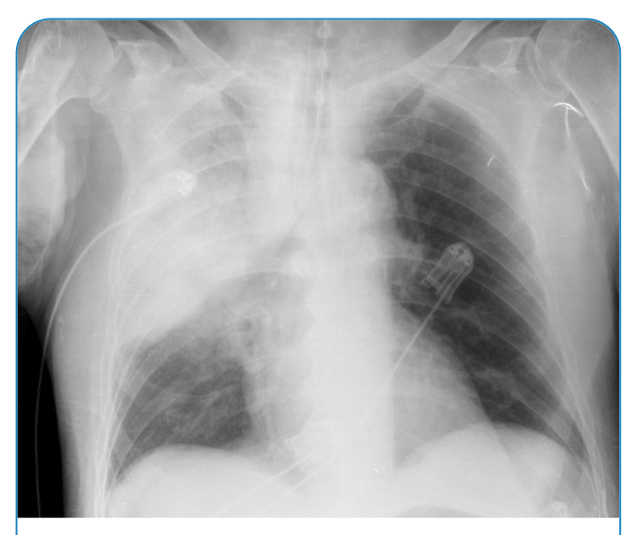
FIGURE 1: Extensive consolidation in the right upper lobe with air bronchogram and signs of bulging interlobar fissure.

left shift, and lactic acidosis. Chest radiography revealed right upper and middle lobar consolidation ( Figure 1 ). Ceftriaxone was initiated; however, the patient maintained severe metabolic acidosis, hemodynamic instability, and difficult ventilation. In less than 24 h, he died, and necropsy was requested to clarify the case. Blood culture (released a few days after death) showed AB growth, and necropsy revealed acute lobar pneumonia as the underlying cause of death.