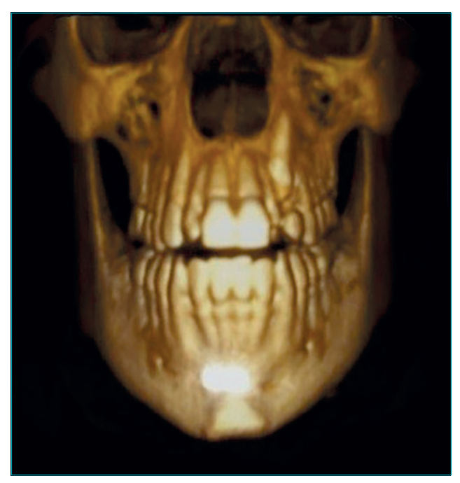
Figure 2 Frontal three-dimensional image.

The present report shows absence of differences in radiographic density of pigmented teeth in relation to enamel organ, without color change after cone-beam volumetric CT scan. This method allows examining the human body in segments with few millimeters of thickness, which helps to diagnose pathologies that affect bone tissues, besides