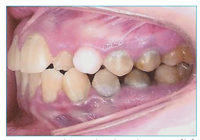
Figure 1 Intraoral view with prolonged retention of left superior deciduous canine and greenish pigmentation of teeth.

Dystrophic calcification in maxillary sinus originates from an inflammatory picture with chronicity characteristics and may be related to fungal or non-fungal sinusitis.