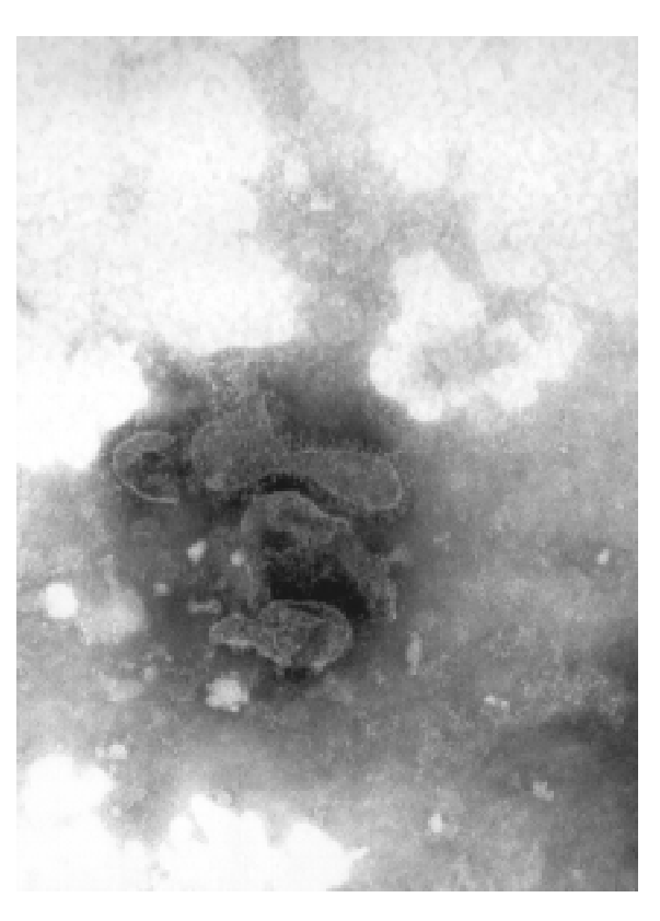
Figure 1 – Electron microscopy showing a corona-like virus, x 222K (negative strain).

The higgest frquency of viruses was observed in animals of Group 2: 10 positive samples (10%) for CPV-like viruses and 3 (3%) for CCV-like viruses.