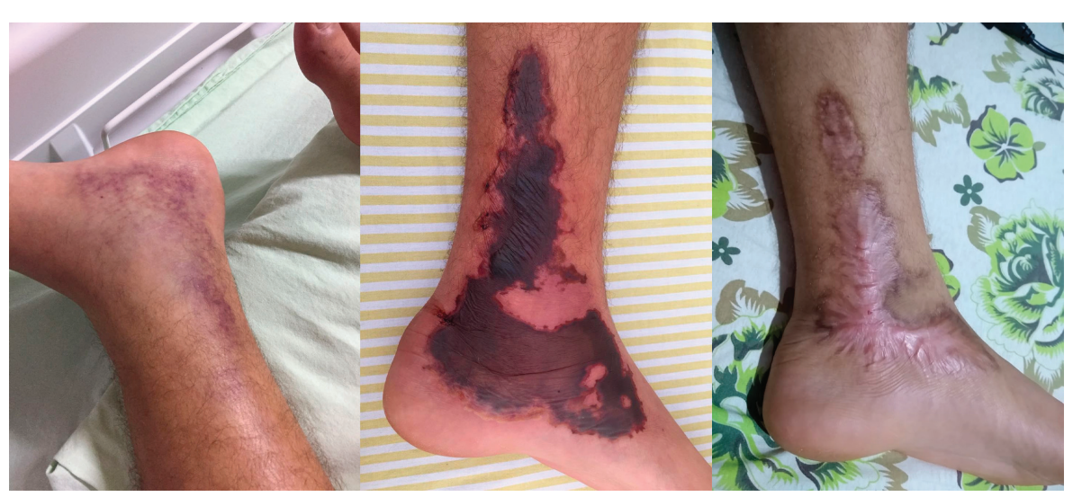
Figure 1 - Evolution of lesions on the extremities over 6 months.

Dengue is one of the most prevalent arbovirus infections in Brazil with an incidence of 690.4 cases per 100,000 inhabitants<sup>3</sup>. Fever is the first manifestation, associated