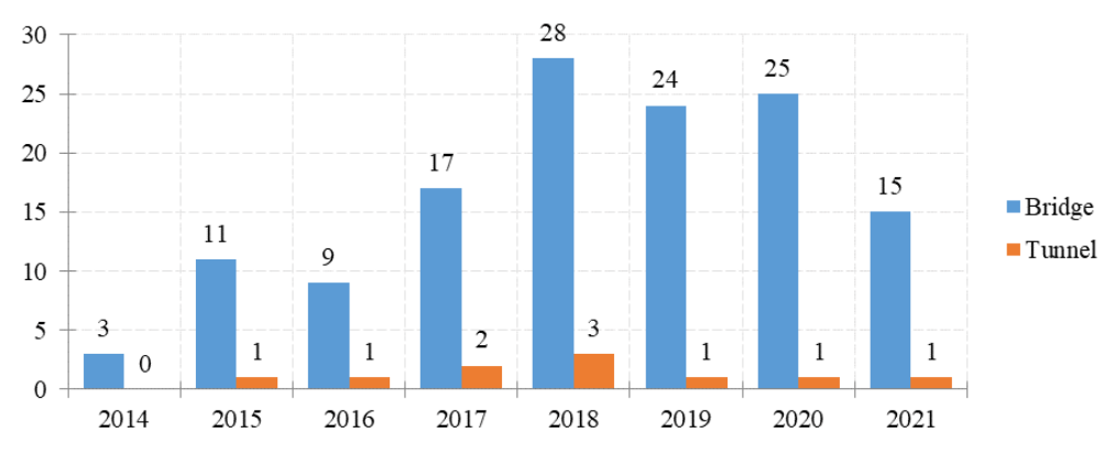
Figure 1. Number of documents published through the years concerning bridge and tunnel inspections using UAVs.

documents from 2018 onward, indicating a growing interest on UAV employment for inspection of these large structures and its importance in the civil infrastructure field.