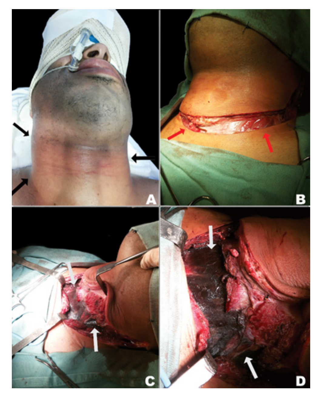
Figure 1. A) Edema observed in the cervical region (black arrows). B) Cervical incision made for access (red arrows). C and D ) Exposure and a wide range of necrotic tissue (white arrows).

The result of the microbiological culture exam was performed from the collection on the second day of hospitalization. The result showed the presence of Staphyloccocus hominis Subsp. hominis. This strain was having sensitivity to daptomycin, linezolid, rifampicin, synercid, tetracillin, and vancomycin. However, the test result was only available to the team after five days of collection.