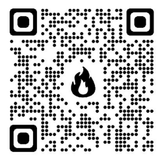
Figure 2 – QR-code of supplementary information and virtual availability of the comic book. Londrina, Paraná, Brazil, 2021

In the third stage, 38 participants were approached, of which two were illiterate, three refused to participate, one was unable to complete the VFT due to mental confusion and two presented procedures at the time of collection, then were transferred to the Intensive Care Unit (ICU), making participation impossible. Thus, the sample consisted of 30 participants, being 21 patients and nine companions.