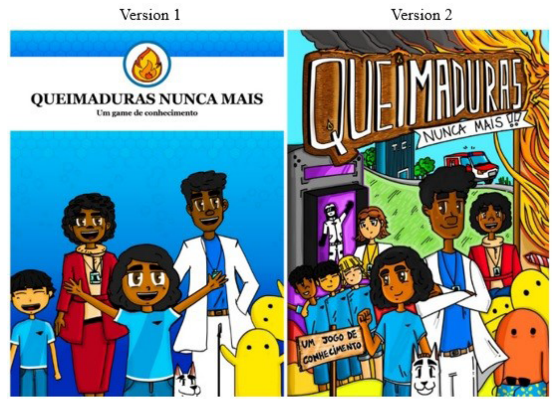
Figure 3 – Comic book cover before and after reformulation. Londrina, Paraná, Brazil, 2021