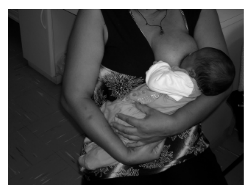
Figure 1 - Correct infant position at breastfeeding.

As per the characteristics of the correct breastfeeding position, the infant's body has to be close to and directed at the mother, his buttocks must be supported, his head and body must be aligned with the mouth, on the same horizontal line to the breast, facing the areola<sup>(9,15)</sup>(Figure 1). The correct attachment to the nipple-areola region is an important step to trigger the breastfeeding process. The infant's lips must be turned outwards, his mouth wide open, round cheeks, and the chin must touch the mother's chest<sup>(7)</sup> (Figure 2).