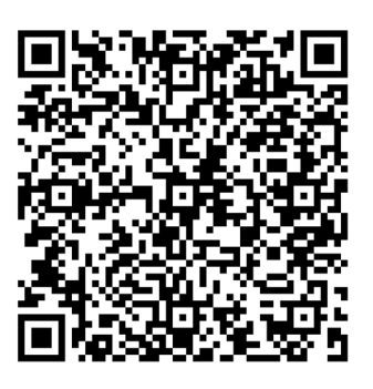
Figure 1. QR Code to access the Demystifying Alternative Communication podcast

The initial interview with the parents/guardians qualitatively showed (data not presented) that they had frequent questions and uncertainties about the method used in the study. There is a gap in the process of informing professionals and families about AC, and many myths still surround its application. This was the main motivation to construct an additional product for this study, the 10-episode podcast in Portuguese, to present scientific data and further clarify the method to professionals and families. This material is available for free on digital platforms; it can be accessed by reading the QR code below (Figure 1).