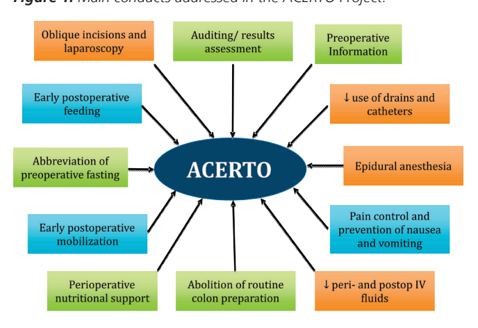
Figure 1. Main conducts addressed in the ACERTO Project.