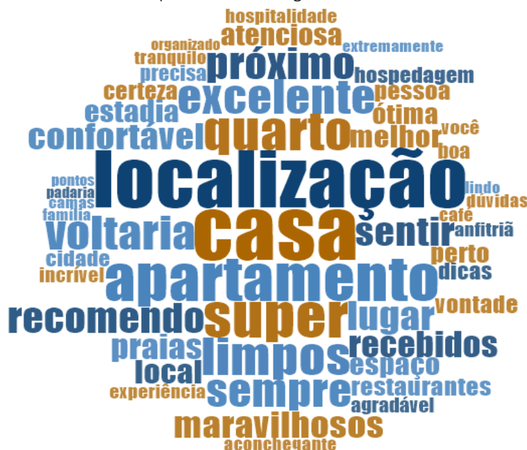
Figure 1 – Word cloud with frequent terms in Airbnb guest reviews

For the purposes of this research, some terms were removed from the cloud because they did not add expressive meaning to the analysis, including first names, definite and indefinite articles, numerals, conjunctions, prepositions, etc.