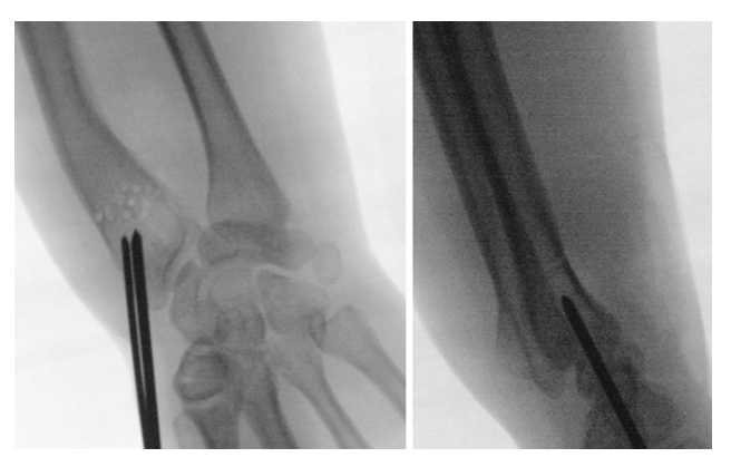
Fig. 3 Introduction of two Kirschner wires (2.0/2.4 mm) parallel or divergent to each other at the level of the radial styloid, towards the metaphyseal region of the previously fenestrated distal radius, without passing beyond it.