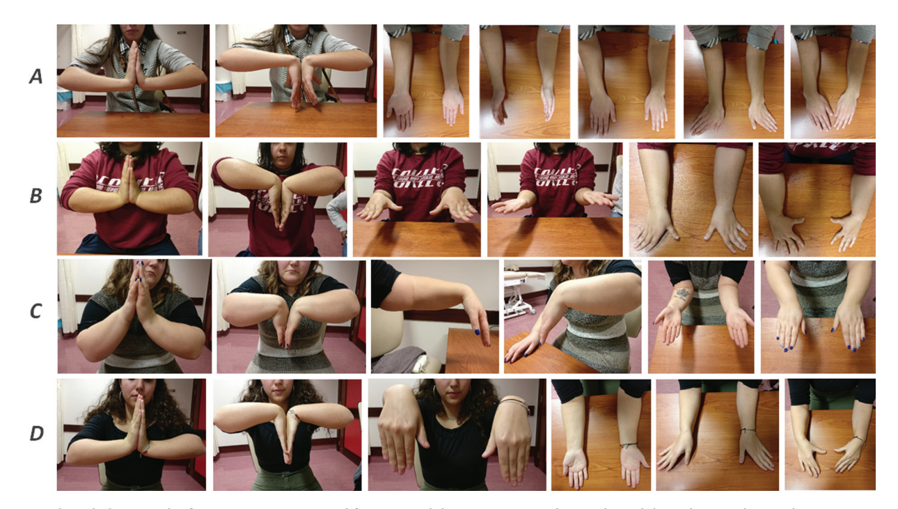
Fig. 6 Clinical photograph of postoperative wrist and forearm mobility. A - patient submitted to a bilateral surgical procedure; B - patient submitted to a bilateral surgical procedure; C - patient submitted to a surgical procedure on the left wrist; D - patient submitted to a surgical procedure on the right wrist.

Abbreviations: Δ, variation; DASH, Disabilities of the Arm, Shoulder and Hand; VAS, visual analog scale.