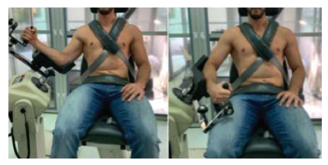
Fig. 3 Photo of the patient's isokinetic evaluation.