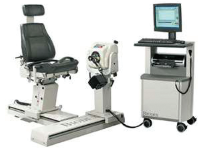
Fig. 2 Biodex 3 System Pro ® dynamometer.

The deltopectoral approach was performed with an incision of approximately 5 cm, followed by osteotomy of the coracoid process and fixation of the graft in the anteroinferior region of the glenoid through a longitudinal incision in the middle third of the subscapularis tendon, with one or two screws (Bristow or Latarjet). The coracoacromial ligament was not sutured. All patients participated in the same rehabilitation protocol as our institution. A velpeau-like spoy was maintained for 3 weeks full-time, starting after the 3<sup>rd</sup> week controlled passive movements as well as scapular control exercises. After the 6<sup>th</sup> week the active exercises were initiated and after 10 weeks strengthening and stretching exercises were introduced. The return to the sport was allowed after 4 months.