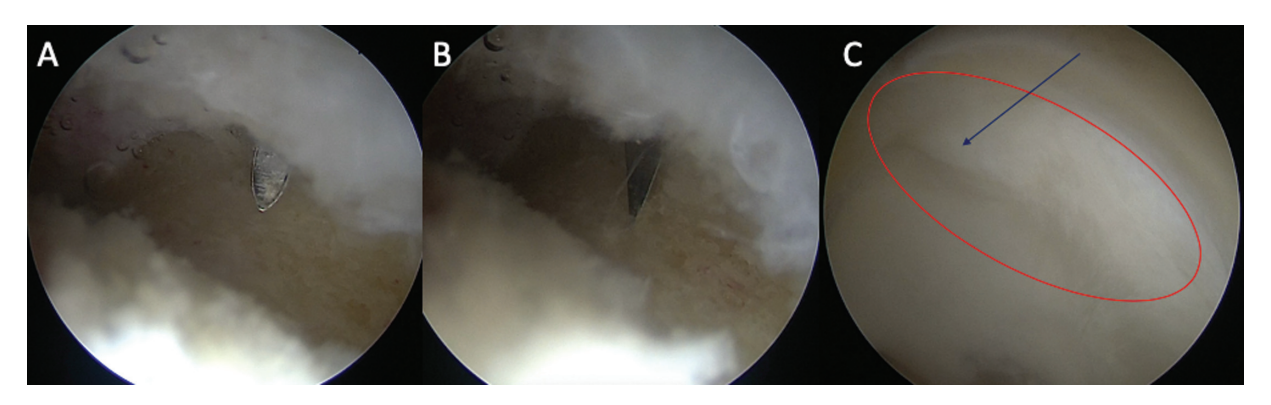
Fig. 1 (A) Image showing the cannulated introducer and the desired position to place the 2.3-mm drill. (B) Image showing the drill, and the beginning of the drilling process. (C) Image of the wave lesion (red ellipse) and subchondral bone drilling sparing the cartilage (arrow).

Nineteen medical records from a total of 28 operated patients were selected and included in the study. The following data were evaluated: gender, age, laterality, date of surgery, type of femoroacetabular impingement (FAI), magnetic resonance imaging (MRI) findings at the time of diagnosis and 6 months after surgery, and functional assessment using the Harris Hip Score (HHS) and visual analog scale (VAS) for pain preoperatively, and 3 and 6 months after surgery. For the VAS, scores from 0 to 2 indicated mild pain, from 3 to 7, moderate pain, and from 8 to 9, severe pain (►Table 1).