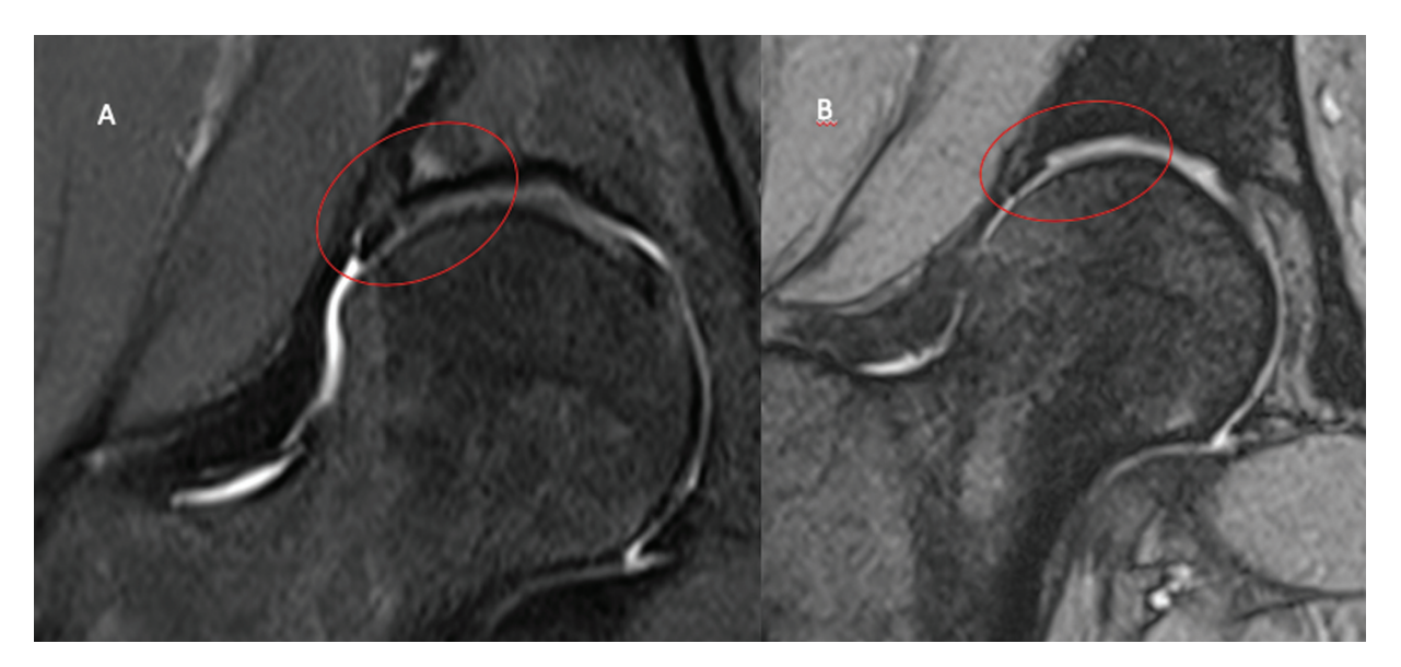
Fig. 4 (A) Highlighted preoperative image corresponding to wave lesion showing the altered cartilage at the chondrolabral junction. (B) Six months after surgery, a highlighted image shows that the cartilage submitted to microfracture presents the same signal and features from non-injured areas.

The improvement in the HHS and VAS for pain is consistent with the literature, showing a progressive symptom reduction when comparing scores from the preoperative period to 3 and 6 months after surgery. Preoperative MRI revealed a darkest injured chondral region, with reduced signal in the DP FAT SAT- and GRET2 echo gradient-weighted sequences compared to the healthy acetabular cartilage. Six months after the reverse microfracture, the MRI showed that the treated cartilage had the same signal as the adjacent, uninjured cartilage in 18 patients, potentially suggesting that the cartilage is healthy and adhered to the subchondral bone, corroborating the clinical and functional improvement.