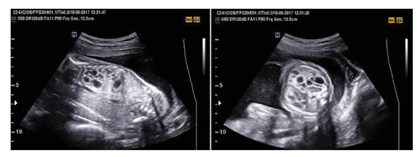
Fig. 1 Prenatal ultrasonographic features of a CPAM case in our series.

The mean maternal age in these 19 cases was 27.5 (19–37 years. We observed that 68.4% (13 out of 19) of the