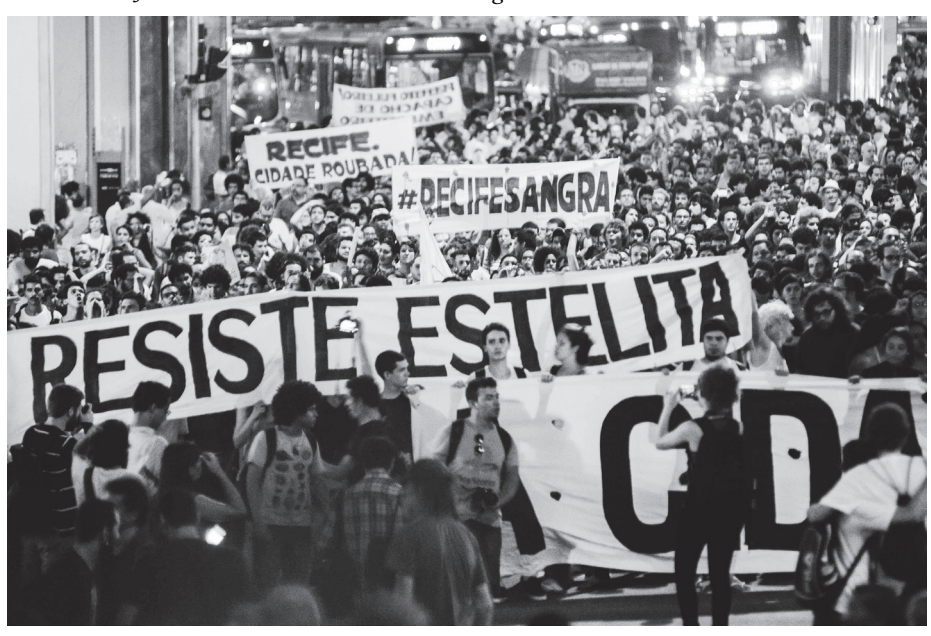
Figure 5: Walk after the approval and ratification of n°08/2015, covering the Local Plan for the Cais José Estelita, Santa Rita and Cabanga