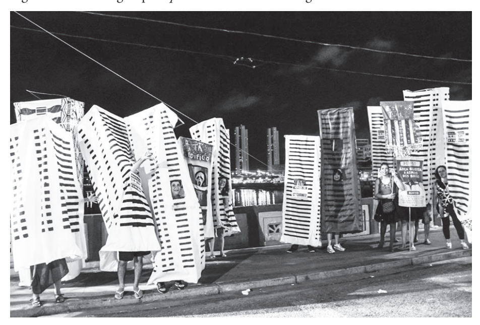
Figure 8: Carnaval group Empatando tua vista showing the "Twin towers"