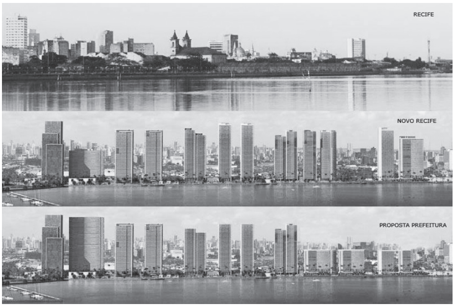
Figure 4: Simulation of the proposed remodelling presented at Recife Town Hall