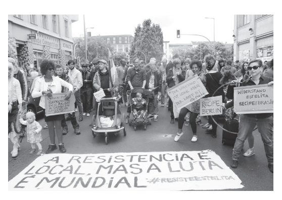
Source: Photo by Sabrina Tenório, International movement of support for the occupation of Cais Estelita.