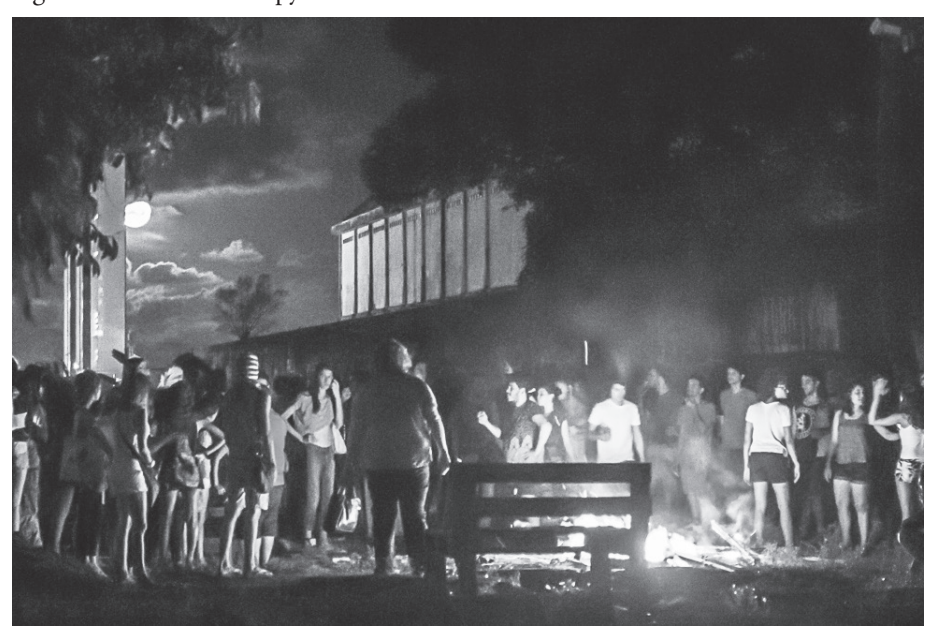
Figure 6: Militants occupy the Cais Estelita once more