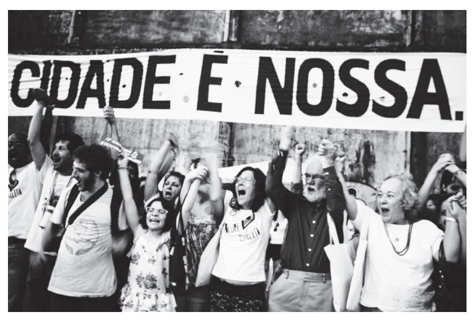
Figure 3: David Harvey at the Ocupe Estelita