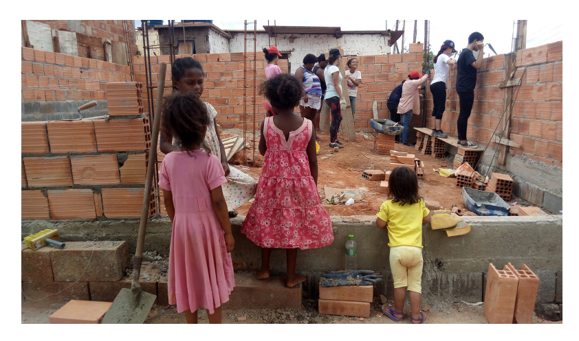
Figure 6. Construction workshop for women in the Rosa Leão Occupation

An intersectional approach to spatial practices in the city approaches what McKittrick (2006) defined as Black geographies. In this conceptual model, Black histories are linked together by the ways in which they respond to geographic domination. Thus, Black geographies bring out alternative patterns that work alongside and beyond traditional geographies and places (McKITTRICK, 2006, p. 17).