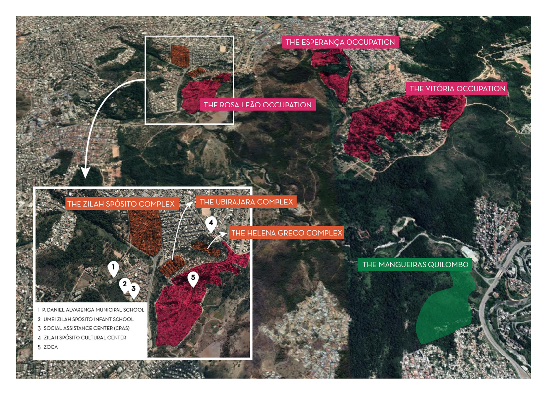
Figure 1. The Region of Izidora