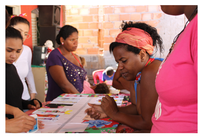
Figure 4. Cartography workshop in the Rosa Leão Occupation

disputes fought in Rosa Leão with more recent residents, supporters and public authorities. These exchanges were also fueled by civil construction workshops for women (Figure 6), which became a space-time for mutual learning and powerful discussions (SILVA, 2018; CRUZ; SILVA, 2019).