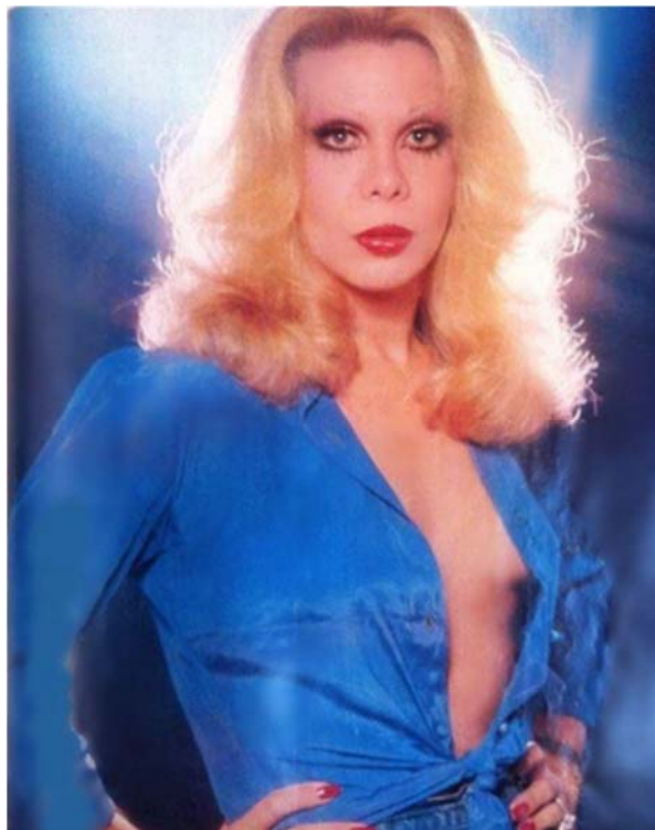
Figure 6 – Rogéria in an image from the 1970s.