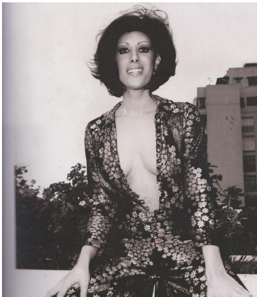
Figure 5 – Divina Valéria at the start of the 1970s.

But of them all, Rogéria (Figure 6) was undoubtedly the most celebrated. Acting in theatre, film and television, she became a reference for audiences across different generations – from those who saw her in the revue theatre in Les Girls , back in 1964, to those who watched Divinas Divas (2016), a film by Leandra Leal (Figure 7), as well as her remarkable television roles, such as Ninete, in the soap opera Tieta (1989).