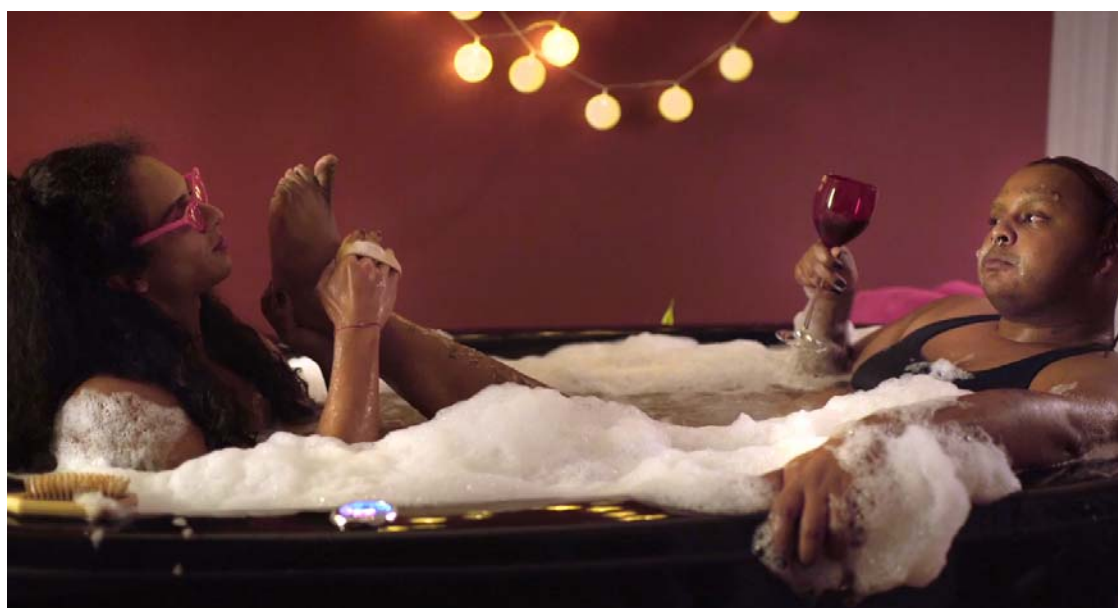
Figure 12 – Linn da Quebrada and Jup do Bairro in the film Bixa Travesty (2018).