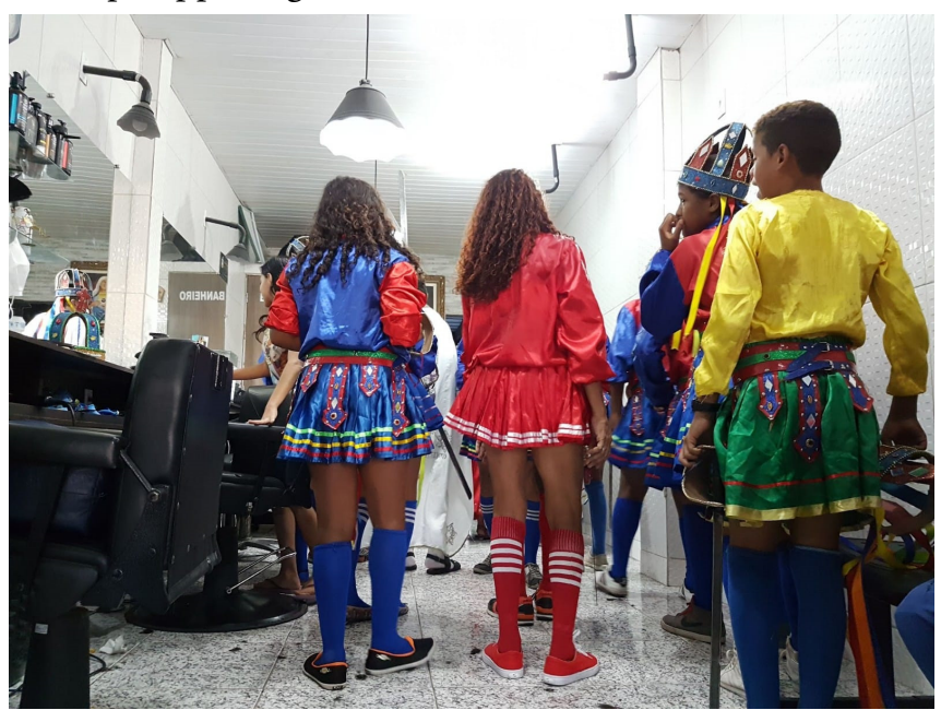
Figure 6 – Quilombo singing at the Salon stop (2019).

and whistle, Pinto asks to form the line. Meanwhile, Master Xexéu has a beer and hands a can to the zabumbeiro. In the quilombo almost nothing stands still, even in the moments of pause, the duels, the exchanges, and the encounters keep happening all the time.