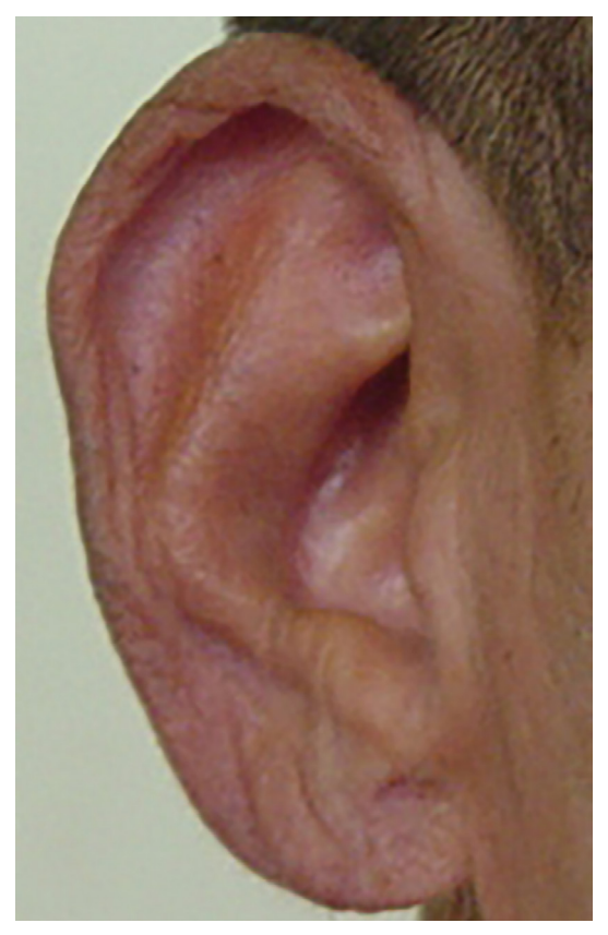
Figure 5. Right ear - postoperative - oblique angle.