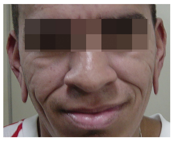
Figure 3. Preoperative image of patient's ears.

delineate an angle which may have different proportions depending on the proportion of the ear to be resected.