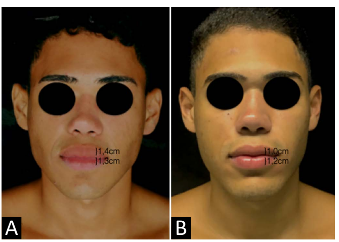
Figure 3. A. Preoperative; B. Postoperative 3 months.

The main etiologies of macroqueilia are racial characteristics and biological inheritance. Other causes can be inflammatory diseases<sup>6</sup>, congenital malformations<sup>7</sup>, and iatrogenic procedures<sup>8</sup>. The use of the macroqueilia approach is described by Zanini et al. (2005)<sup>3</sup> in the Melkersson-Rosenthal Syndrome, Hauben (1988)<sup>7</sup> in the lip hemangiomas, Botti (2002)<sup>8</sup> for correction of injection of alloplastic products and Niamtu (2010)<sup>9</sup> in the various macroqueilias. It only consisted of excising a horizontal or vertical soft tissue wedge in the upper and lower lip to decrease their size,