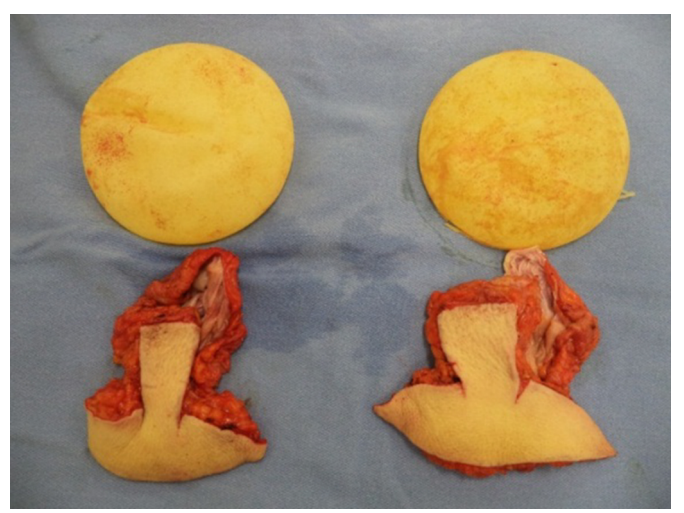
Figure 4. Separation of implants and breast tissue.