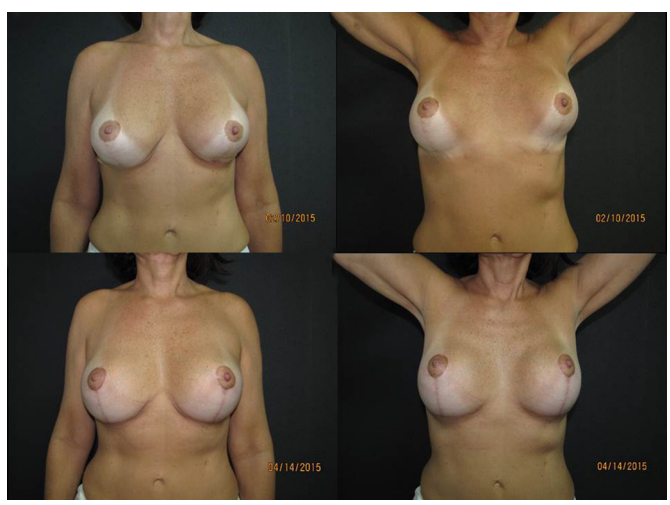
Figure 9. Results report.

Although implants are not completely covered by the pectoral muscle, covering the superomedial portion of the implant provides a natural result. In addition, a careful detachment of the lower part of the pectoral muscle and the maintenance of medial and lateral insertions allow implant accommodation, providing greater stability and reduced risks of postoperative displacement<sup>3,19,26</sup> (Figures 9A-9D).