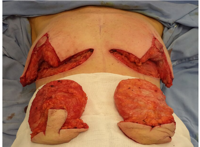
Figure 3. Bilateral resection.

The same procedure was performed on the contralateral breast, followed by bilateral total en bloc resection of the structures (Figure 3). The capsule was opened outside the surgical field for analysis of integrity, deformities, type, and size of the patient's implant (Figure 4). After delimitation and symmetrization of the detached areas in both breasts, bilateral retromuscular pockets were made starting with the incision of the pectoral muscle in the nearest portion of the mammary fold<sup>3,7</sup> (Figure 5).