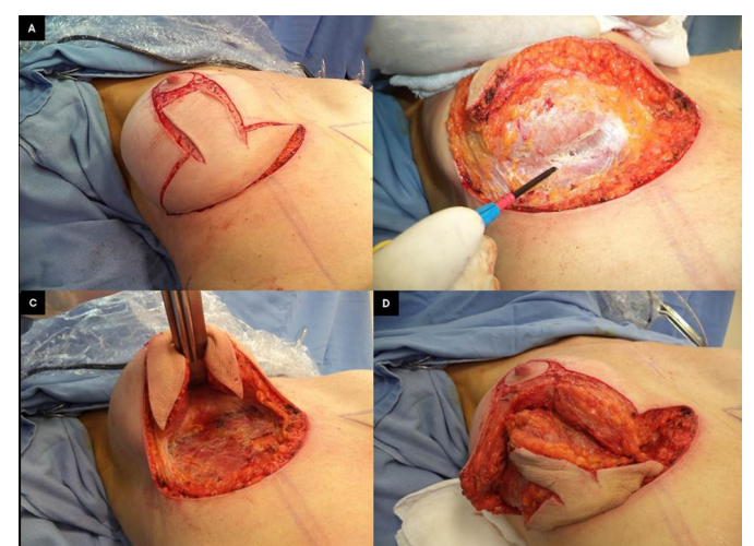
Figure 2. En bloc resection of the skin, breast tissue, fibrous capsule, and implant.

hemostasis and the perfect separation of the capsule and surrounding tissues.