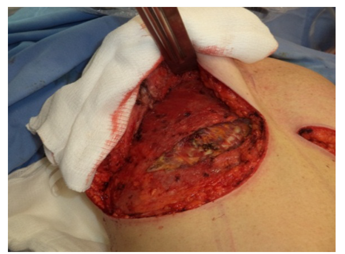
Figure 5. Incision in the pectoralis major muscle to prepare a retromuscular pocket.

After detachment of the pectoralis major muscle up to the medial insertion limit – as necessary to accommodate the new implant and to avoid superior displacement due to pressure resulting from muscular action – hemostasis was rigorously tested in the anterior and posterior regions of the muscle, bilaterally.