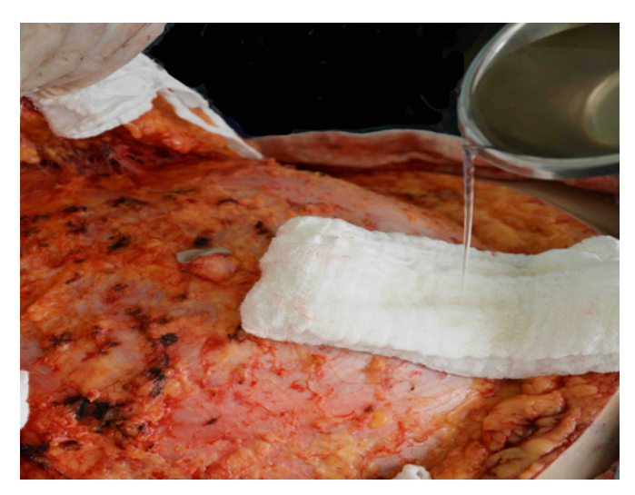
Figure 1. Washing with saline solution.

abdominis are followed by washing with 1 liter of 0.9% saline solution, using dressings to mechanically debride the surface of the flap and abdominal wall fat tissue (Figures 1 and 2).