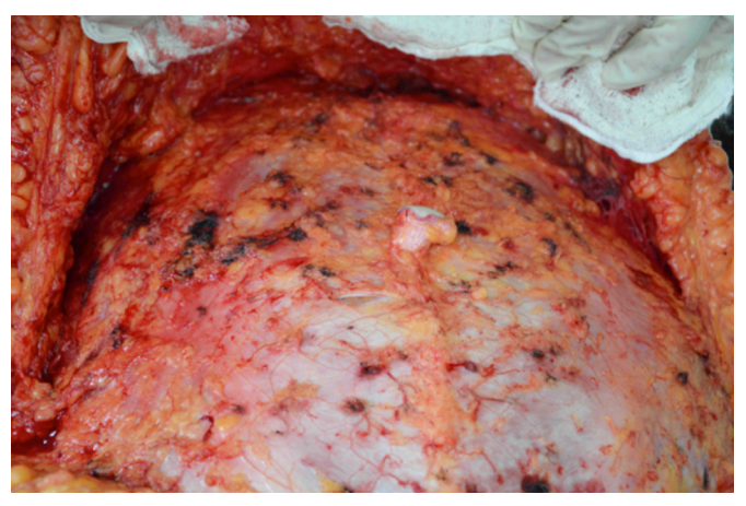
Figure 3. Bleeding points that could cause postoperative hematomas.

A retrospective review was conducted by analyzing the electronic medical records of 183 patients who underwent the procedure, performed as a routine technique by the surgical team and during an abdominoplasty performed between May 2011 and August 2015. During the procedure, no fixation points were made on the flap and a vacuum drain was placed with an outlet to the inguinal crease, as described by the