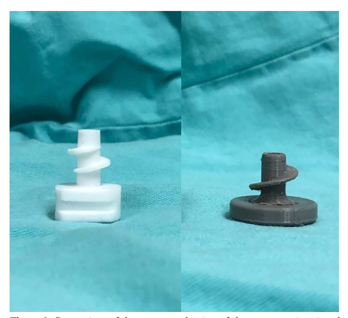
Figure 3. Comparison of the screw mechanism of the prototype (\mbox{gray}) and the model device (white).

Animal tests were carried out on two pigs provided by the Veterinary Medicine sector at Universidade Positivo (Curitiba/PR). One of the authors conducted the procedures in the vivarium's operating room, with the animals submitted to assisted painless death just before the procedure.