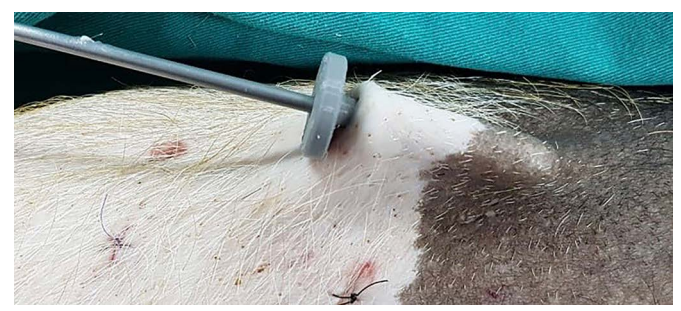
Figure 4. Prototype inserted and cannula positioned.