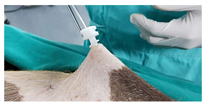
Figure 7. Intense traction of the old device (white). It is possible to notice that the device starts to detach itself, losing the lock.