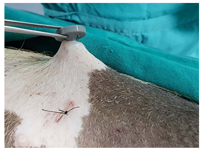
Figure 6. Intense prototype traction (gray). The device remained stuck to the skin.

Both devices had good locking in the light traction test, but in intense traction, the old model device started to detach from the skin since the prototype maintained the locking (Figures 6 and 7). Only in an incision of an animal did the old device remain locked under intense tension. The skin had an adjacent burn, edema, and serous secretion in the incision after 20 minutes of liposuction simulation without the device. However, when using the device, the skin remained intact and unchanged. The minimum incision for the prototype's insertion (10mm) was slightly larger than the conventional incision (6mm). In two incisions, one in each animal, the prototype incision size was eight and nine millimeters (Figure 8). Both the appearance and the average size were very similar in the other incisions.