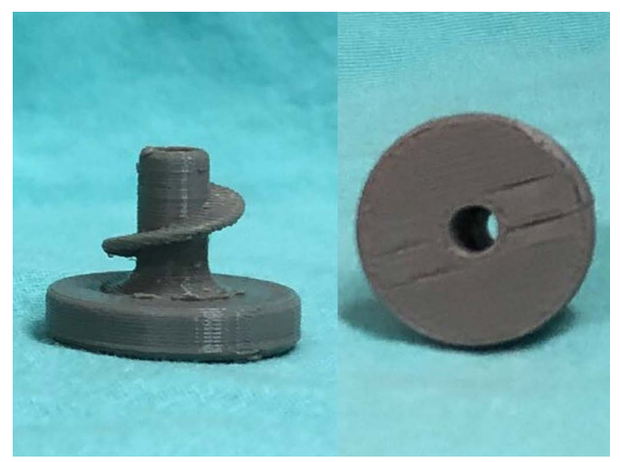
Figure 2. Prototype printed in PLA. Profile and basal view.

Prototypes were designed using SolidWorks 3D CAD software (Dassault Systèmes SolidWorks Corporation, MA, USA) and printed on a MakerBot Replicator + 3D printer (MakerBot Industries, NY, USA) using lactic polyacid (PLA) as the printing material (Figure 2). The design of our own creation, is 1.9 cm high and 2.5 cm wide. The prototype base is rounded and with shallow grooves to facilitate manual locking. The thread, with a less spaced spiral and with a larger diameter, aims to facilitate its insertion while increasing its potential to lock into the skin (Figure 2). The difference between the screw mechanism of the prototype and the model device is evident in the side view (Figure 3).