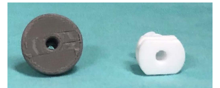
Figure 5. Comparison of the base of the old device (white) and the prototype (gray).

Both devices had good locking in the light traction test, but in intense traction, the old model device started to detach from the skin since the prototype maintained the locking (Figures 6 and 7). Only in an incision of an animal did the old device remain locked under intense tension. The skin had an adjacent burn, edema, and serous secretion in the incision after 20 minutes of liposuction simulation without the device. However, when using the device, the skin remained intact and unchanged. The minimum incision for the prototype's insertion (10mm) was slightly larger than the conventional incision (6mm). In two incisions, one in each animal, the prototype incision size was eight and nine millimeters (Figure 8). Both the appearance and the average size were very similar in the other incisions.