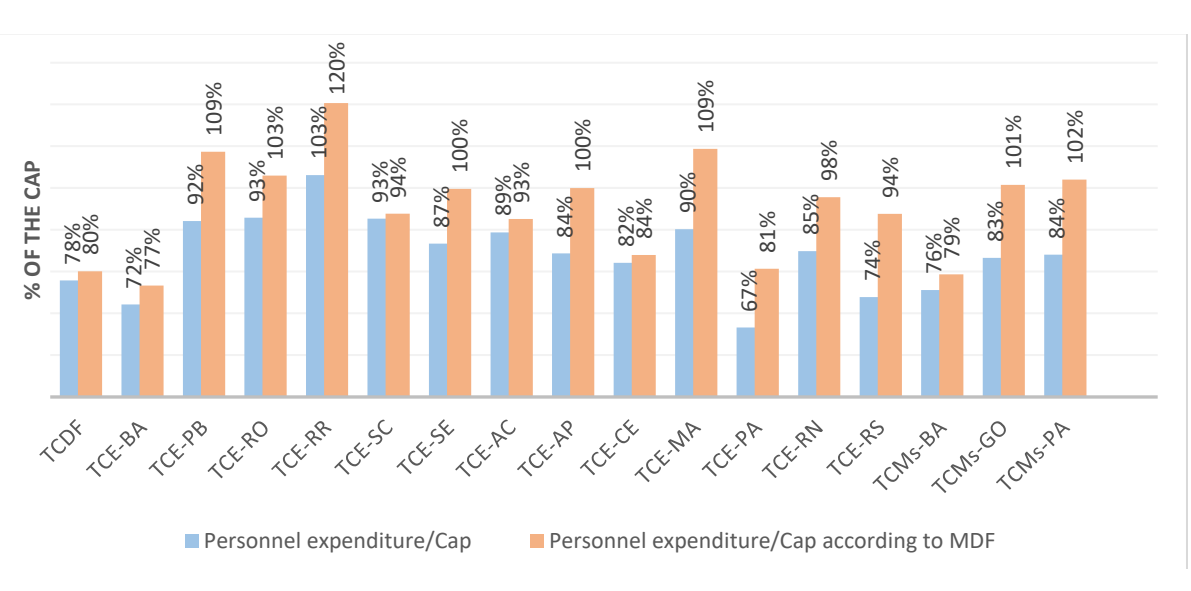
FIGURE 2 LIMITS OF THE EXPENSE WITH PERSONNEL IN 2017