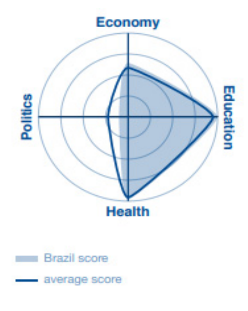
FIGURE 2 BRAZILIAN PERFORMANCE AT GGGR 2018

By illustrating the similarity between performance at the state level and national performance, Figure 2 summarizes the Brazilian results at GGGR 2018, which has good performances in health and education, but which are still far from ideal in terms of politics and economics.