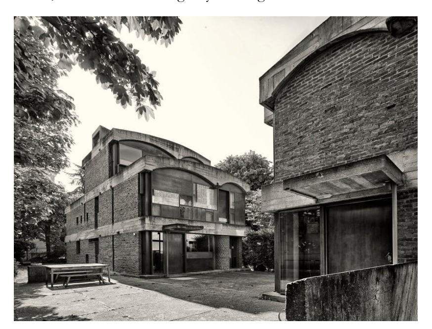
Figure 2 - Maison Jaoul

She also describes the lack of sunlight, her constantly nervous mother nervous, and her childish disappointment upon discovering the lack of secret hideaways. Everyone was uncomfortably watched in that house where everything was connected. Marie remembers that she wanted to stick her drawings on the blue walls but was forbidden by the adults who would say it was unnecessary: the blue wall was a painting in itself. For the child, that house was very beautiful and sad, as a museum. With the construction and furniture under the uncompromising supervision of Corbusier, each thing (and even each person) had its designated place since the project. "We were like statues", she concludes, "the house dictated the law" (Jaoul, 1979, p. 8). Marie Jaoul's report is a good example of Miller's ideas that the houses intervene in the way their inhabitants live, what he calls the "agency of things".