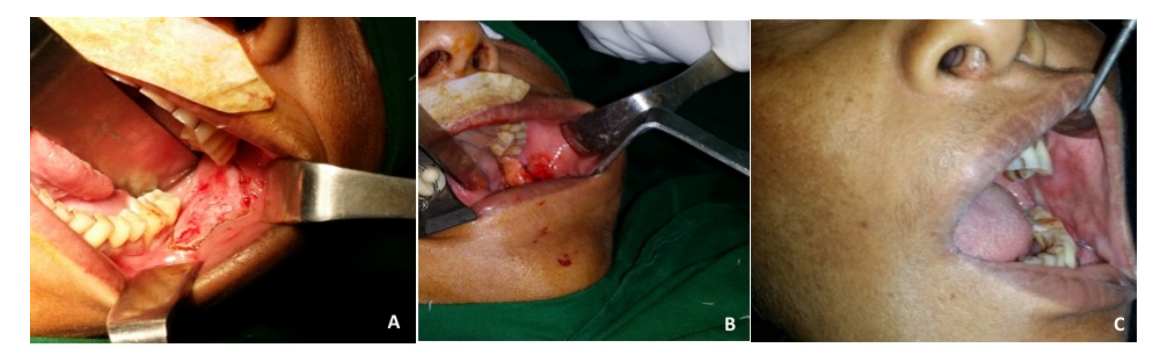
Figure 3. Preoperative (A) and postoperative (B, C) images. Reconstruction done by BPF.