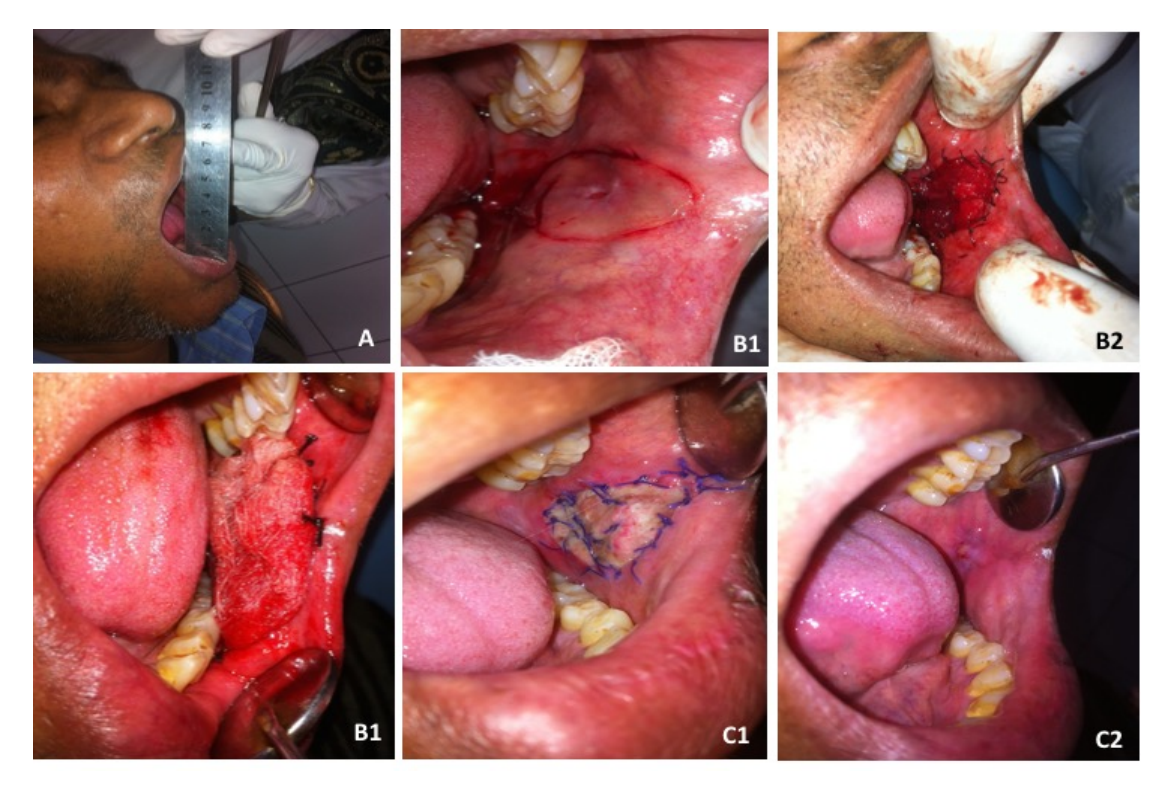
Figure 2. Preoperative (A), Operative (B1, B2, B3) and Postoperative (C1, C2) images. Reconstruction done by FFAM.

Clinical photographs of a subject treated with frozen amniotic membrane and BPF were shown in Figures 2 and 3, respectively.