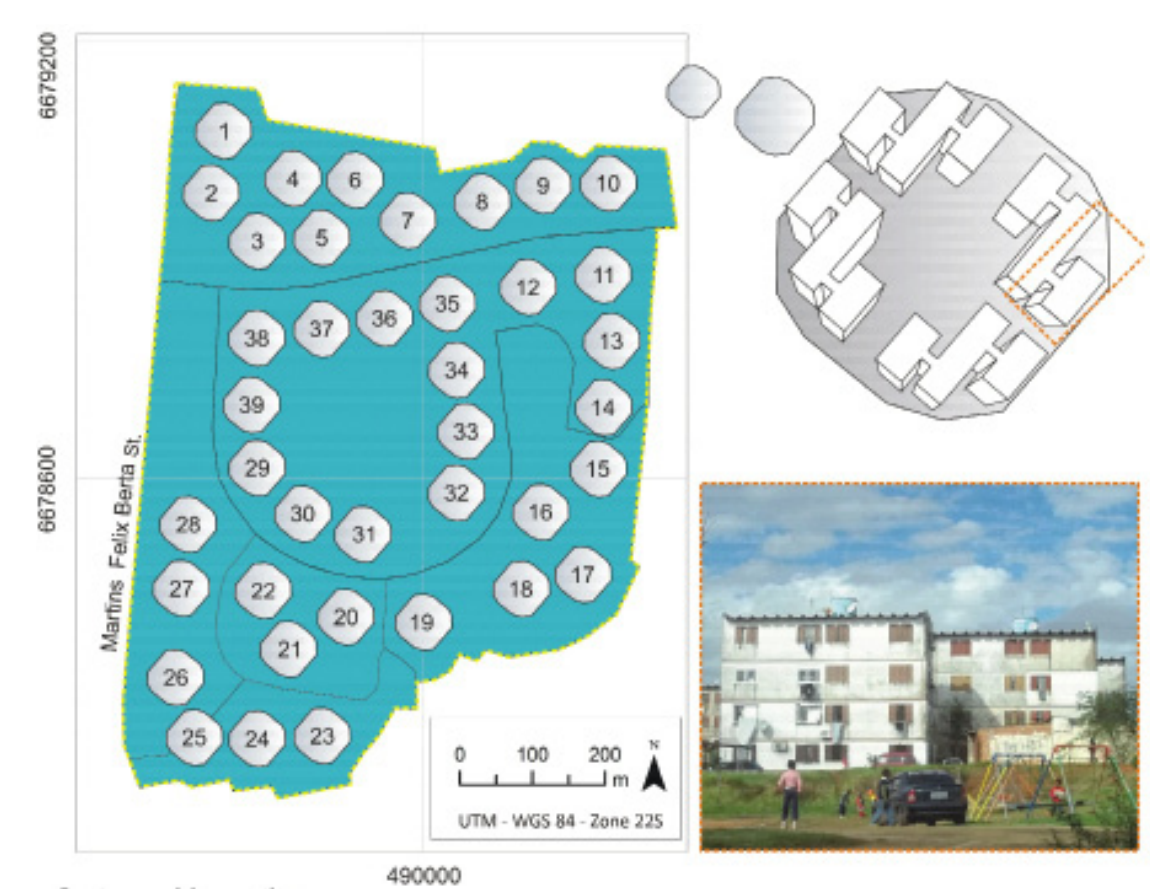
Figure 2 - Map of the housing nuclei of the Rubem Berta Housing Estate, in Porto Alegre, RS, Brazil.