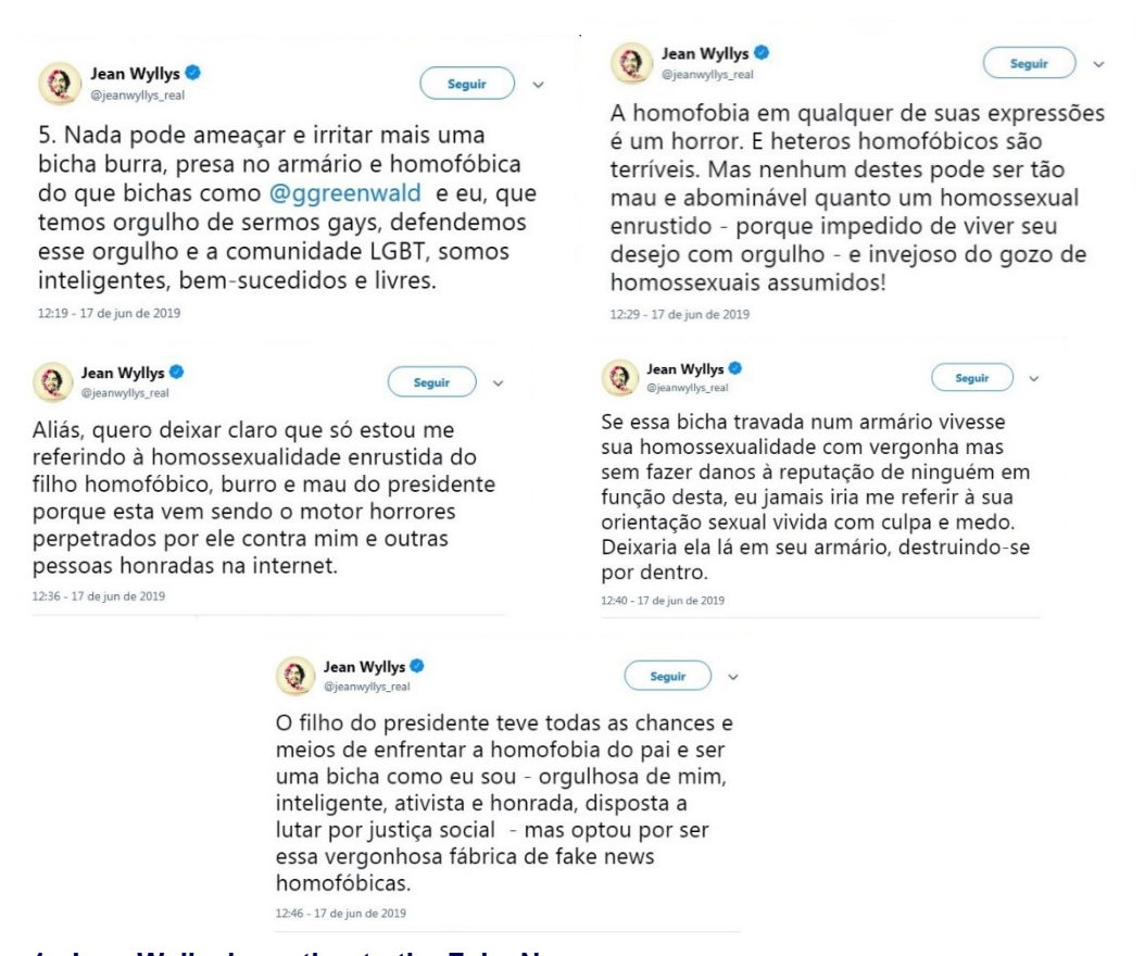
Figure 1: Jean Wyllys' reaction to the Fake News.

The false accusations claimed that Jean Wyllys had "sold" his seat in the Chamber of Deputies to David Miranda, a fellow party member<sup>2</sup>, for U$$ 700,000 plus a monthly "allowance" of US$ 10,000, paid in bitcoins by an unnamed Russian billionaire. There was no proof or even indirect evidence of the accusations and no charges were ever pressed. As a reaction to the defamation against him, Jean Wyllys posted the following tweets: