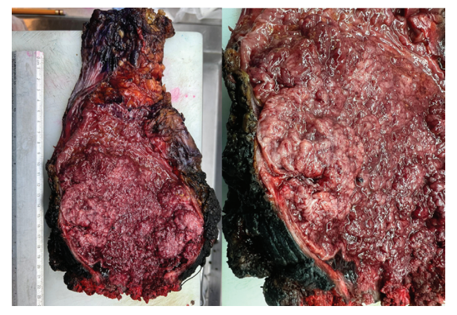
Fig. 3 Product of intersphincteric resection. Macroscopic image of the rectal tumor.

in the lower, middle, and upper rectum, located 4.1 cm from the anal margin, with involvement of all layers of the rectal wall, with diameters in the sagittal plane of 17.1 \times 7.5 cm (► Figures 1 and 2 ).