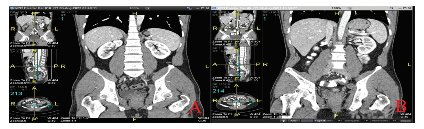
Fig. 3 Partial response to colorectal cancer (A) There are still solid lesions in the intralumen of the sigmoid colon to the proximal rectum, accompanied by thickening of the surrounding wall, slightly reduced in size. (B) Narrowing of the lumen accompanied by irregular wall thickening in the distal sigmoid colon to the anus.

collected, determine the patients who meet the inclusion criteria. Next, divide patients by age, namely less than 50 years and more than 50 years, and divide patients based on histopathological features. Then, determine chemotherapy response from the assessment of CT-Scan results seen through the web-based medical record in patients who have completed chemotherapy. The Response Evaluation Criteria in Solid Tumors (RECIST) Guideline Version 1.0 (RECIST 1.0) was used as a standard for the evaluation of the chemotherapy responses as seen in Figures 1–5 . This study was approved by the hospital's Medical Research Ethics Committee.