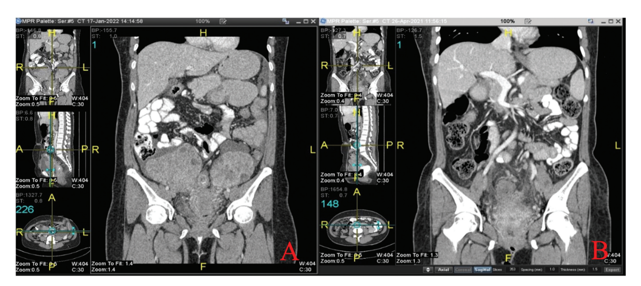
Fig. 5 Progressive diseases: colorectal cancer (A) The mass pushes the small intestine to the superior, to the right lateral, obliterating the caecum, infiltrating the ascending colon and descending colon, and to the inferior, infiltrating the rectum and posterior wall of the uterus. Residual colorectal mass (when compared to previous years, it appears to increase in terms of size; progressive disease according to RECIST guideline version 1.0) (B) Irregular wall thickening is accompanied by narrowing of the lumen in the distal region of the sigmoid colon to the medial rectum that appears to infiltrate the posterior wall of the corpus uteri.