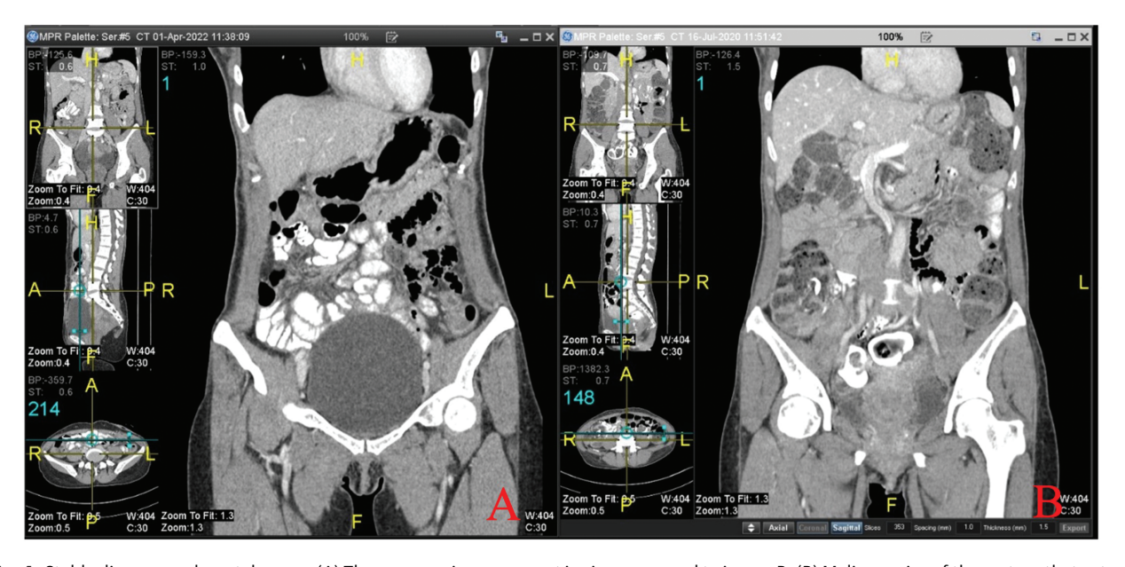
Fig. 4 Stable diseases: colorectal cancer (A) There was no improvement in size compared to image B. (B) Malignancies of the rectum that extend to the inferior part of the anus, to the superior part of the distal sigmoid, as well as to the anterior part of the prostate.

In the histopathological features of patients with stages 3 and 4, the majority of chemotherapy responses are in stable diseases ( -Table 3 ).