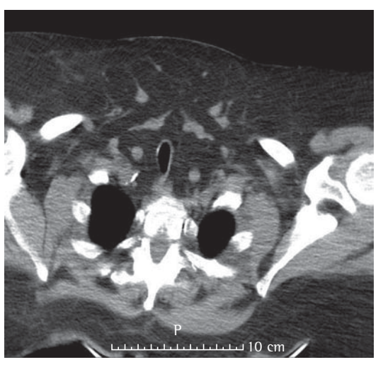
Figure 2 - Cervical CT scan showing areas of fat deposition in the mediastinum, causing a reduction in the trachea caliber of 1 cm transversally and 4 cm anteroposteriorly.

Here, we present a case of diffuse lipomatosis associated with obstructive sleep apnea