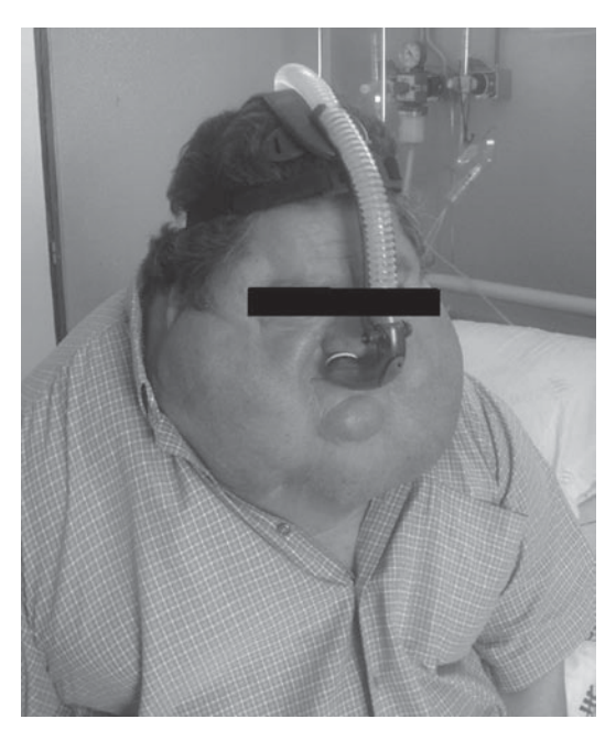
Figure 3 – Large masses around the neck, causing facial deformity. Nasal pillows were used for ventilation.

due to cervical and tracheal involvement, and with facial deformity causing problems in the patient's adaptation to noninvasive ventilation.